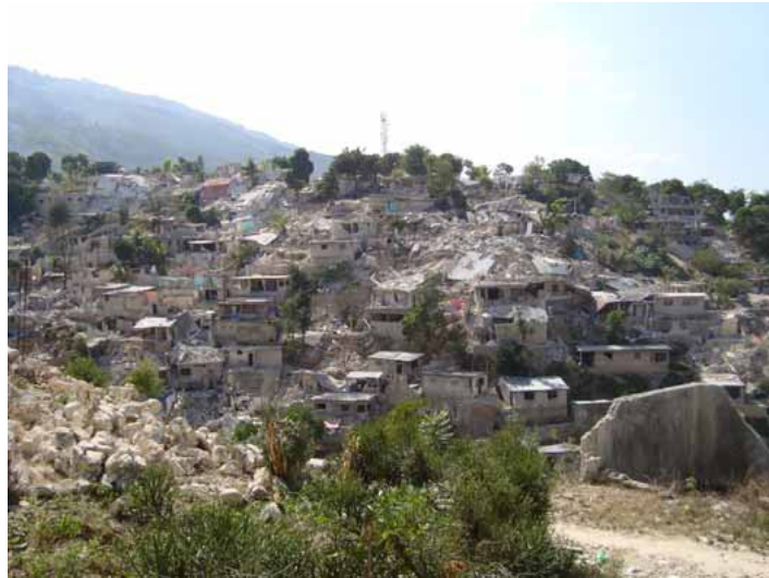
The presence of a fault line beneath the hills of Pétionville makes the area unsuitable for resettling impacted populations.

In addition, there was consensus between communities, the Government and NGOs that settling displaced people in low-lying areas around the city was not practical, given the real risk of flooding from heavy rains or cyclones.