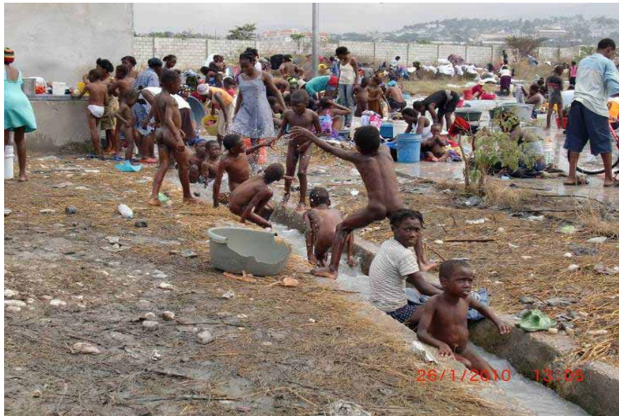
In the absence of adequate sanitation facilities in the camps, children bathe wherever they can find water.