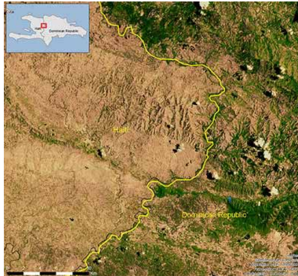
Severe deforestation in Haiti is clearly contrasted with the forest cover across the border in the Dominican Republic.

soil erosion. Haiti's very sustainability had been significantly eroded by resource degradation, including severe deforestation. Environmental governance in the country was also facing severe constraints due to a lack of comprehensive legislation, institutional capacity and the wider economic reality of the country, which had relegated environmental management far down on the list of governmental priorities.