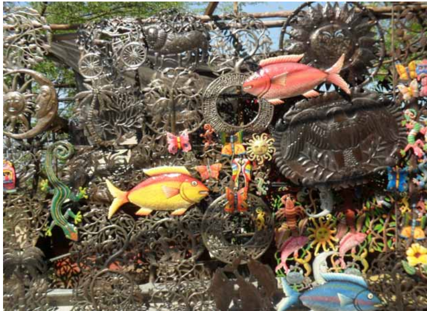
Rebuilding Haiti will require far more than brick and wood – it will require a substantial effort to bring back the country's environmental sustainability