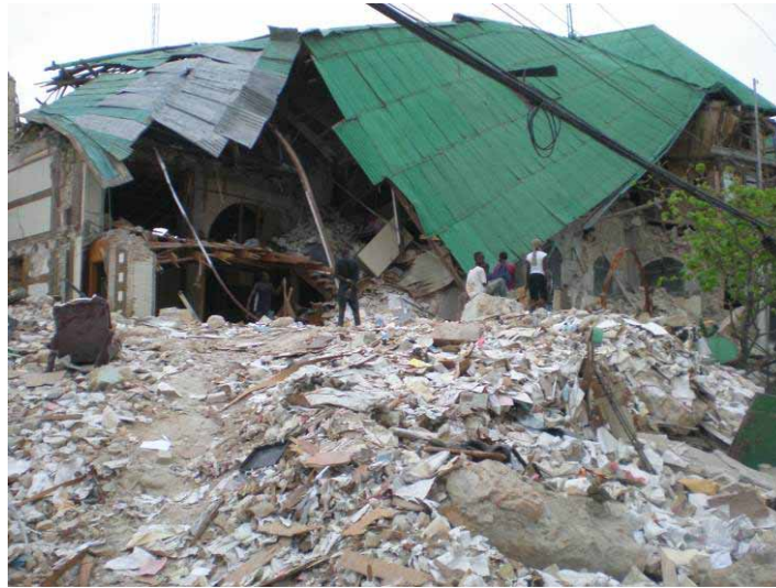
The Haitian Government infrastructure was seriously impacted by the earthquake; above, the remains of the Ministry of Environment.

In addition to the severe damage in Port-au-Prince, several cities and villages in the south of the island were impacted, resulting in extensive death and destruction. The Government has estimated that some 250,000 residences and 30,000 commercial buildings collapsed or were badly damaged. The earthquake has thus led to significant population displacement, with many people, including some whose homes were not damaged, vacating the city and moving out into the open. The United Nations estimates that up to 1.9 million people are in need of food aid for the foreseeable future.