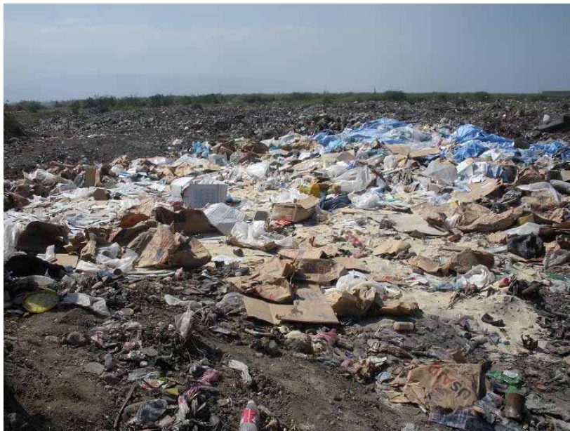
Post-disaster environmental damage is often exacerbated by the absence of effective mechanisms to dispose of the medical waste generated by emergency response operations.

Given the scale of the human tragedy caused by the earthquake, an unprecedented number of patients with varying traumas were taken to medical facilities and to temporary hospitals. Among the concerns for environmental experts was the lack of adequate facilities for the management of healthcare waste in Haiti.