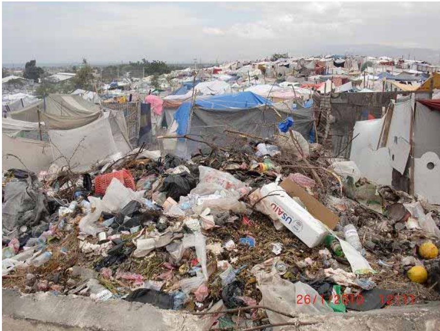
The lack of solid waste management in IDP camps creates many health risks for residents.

In addition to human waste, camps also produce the solid waste that can be expected from any human settlement. There is currently no designated area, collection system or disposal arrangement for solid waste management in the camps. Whenever proper camps are set up, these issues will need to be given due consideration as well.