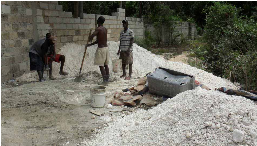
The use of existing approaches to making concrete will rebuild the same vulnerabilities into future construction.

One of the most alarming trends observed in post-earthquake Haiti was that in the absence of a clear understanding of the role played by inadequate design and improper use of building materials, the same building materials are being used to execute repairs and to construct new buildings. This was noted even in the most impacted areas, where the man-made nature of the destruction is by now self-evident. It is imperative that these patterns be reversed to ensure that the vulnerabilities that led to tragic loss of life and destruction are not perpetuated.