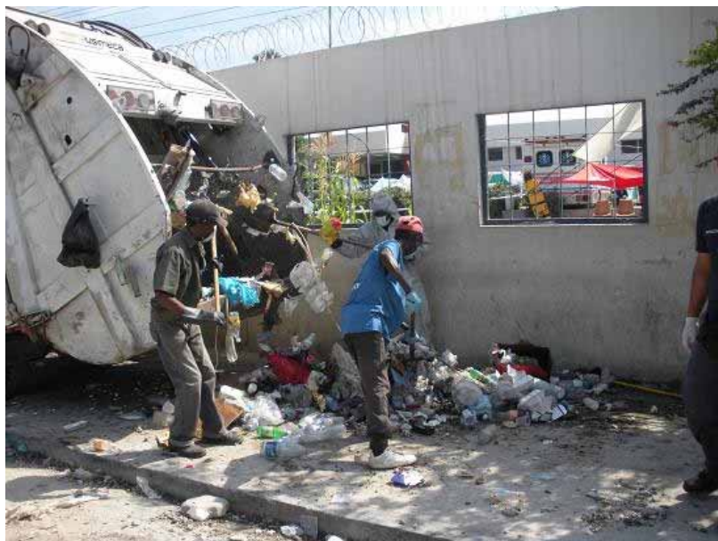
Municipal waste services have resumed across Port-au-Prince, although coverage is still limited.

Municipal solid waste management in Haiti is similar to that of many developing countries, and is characterized by a culture of low wastage and high recycling, coupled with limited institutional management of the facilities for the disposal of those materials that cannot be reused or recycled.