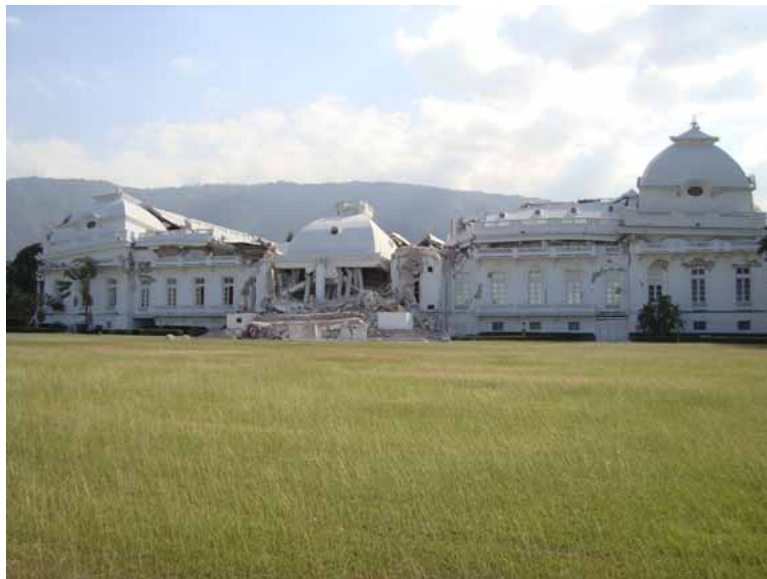
The presidential palace in Port-au-Prince was extensively damaged by the earthquake and will need to be demolished.

The initial response and, to some degree, the ongoing response to the disaster have been impacted by the trauma faced by the occupants of these “lifeline” buildings. Yet, reasonably designed and reinforced structures would have withstood a 7.0 magnitude earthquake, so the question needs to be asked of why these critical buildings did not. There are two main reasons for this.