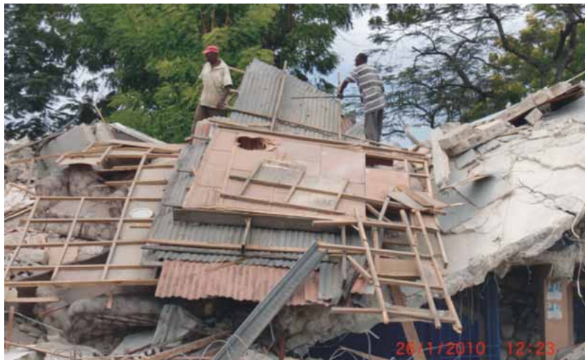
Disaster debris often contains a lot more than just brick and wood.

In fairness hollow bricks, in addition to being easy to make and work with, have a number of advantages. In areas subject to heavy wind and rainfall, they provide stability, and in the past international donor agencies have promoted hollow brick construction as part of disaster risk reduction and community resilience projects in countries with similar vulnerabilities to Haiti. In places where the use of clay for brick-making has caused environmental damage – including threatening food security when paddy fields are used for extracting clay, for example – governments have promoted hollow bricks as environmentally desirable alternatives. Furthermore, building with hollow bricks requires far less cement (for bonding), no mortar and often no paint (both additional costs when conventional bricks are used), making them an unavoidable low-cost alternative and a standard element of construction in the developing world.