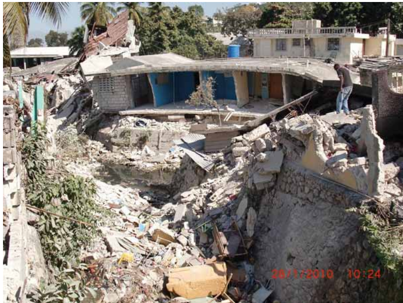
The collapse of municipal waste management services in the immediate aftermath of the earthquake led to the accumulation of everyday waste alongside disaster debris.

Once homeowners and communities will have collected all the material that is safely recoverable, the problem of managing the millions of tons of disaster debris will remain. The ongoing management plan that was initiated by the US Army and funded by USAID is based largely on the collection of concrete in demolition debris and its removal to pre-designated areas where it can be safely disposed of, including in coastal areas.