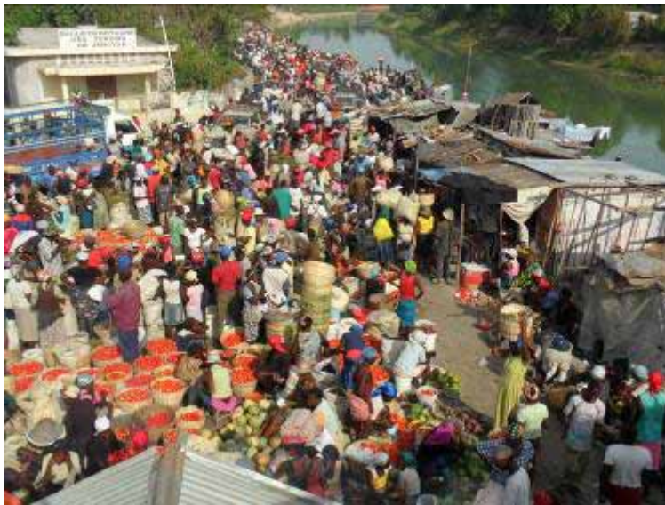
An informal economy quickly reestablished itself in earthquake affected communities, aided by livelihood initiatives promoted by the international community.

While all of the ideas above are good and fit well within the overall humanitarian assistance framework in Port-au-Prince, they may be jeopardizing the longer term plans of decongestion. Indeed, people often react to incentives in unanticipated ways. If land ownership, social services, guaranteed employment and higher wages are provided in Port-au-Prince, individuals in the regions, even those who have not been impacted by the earthquake, will most likely travel directly to the city and set up a tent. Consequently, it is quite conceivable that there will be more people in Port-au-Prince when the reconstruction is over than when it began.