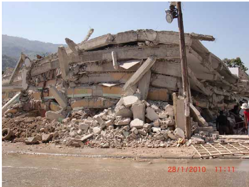
The earthquake caused multiple building storeys to crumble onto each other, compacting everything within.

The situation in Port-au-Prince presents a similar scenario to other earthquake-related disasters, with a large-scale destruction of buildings burying everything below. In addition, a number of buildings that are currently standing are unsafe for use and will need to be demolished, thereby producing even more debris.