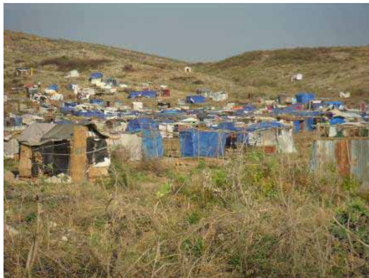
Many new camps were established in the environs of Port-au-Prince in the aftermath of the earthquake.

According to Government estimates, over half a million people left Port-au-Prince in the days following the earthquake. In order to maintain the attractiveness of the regions, the UN team decided to make shelters available on a preferential basis to those who moved to the interior. It was also decided that all relief agencies and NGOs would provide essential support services – food, health, education, employment and counseling – in the regions. In addition, a system for host family support was initiated, whereby any family in the interior that was housing a displaced family member from Port-au-Prince would be given a lump sum, plus a monthly allowance to support them.