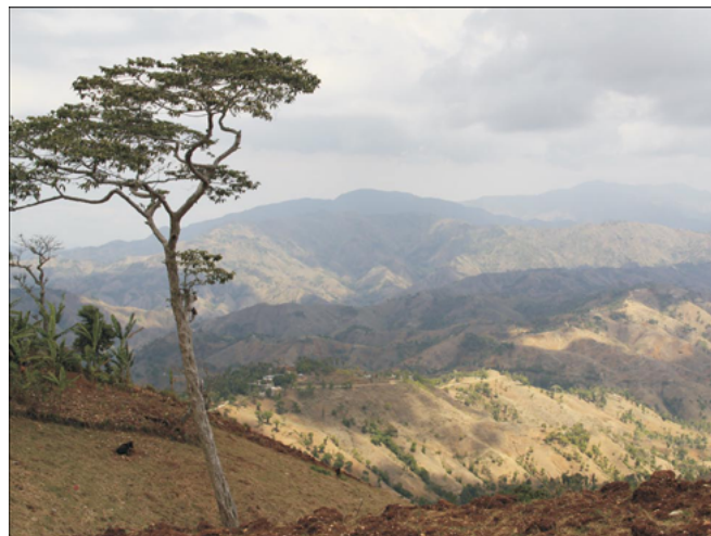
Extensive deforestation and erosion greatly exacerbated physical vulnerability to the January 12 earthquake.

As a result, Haiti suffered significantly more than its neighbour the Dominican Republic during the frequent cyclones and tropical storms that hit the Island of Hispaniola, and in the rainy seasons. A cursory look at a “Google Earth” image of the island shows a clear contrast between the eastern and western parts. The eastern two thirds appear green (covered in forests and vegetation), while the western third appears almost completely brown (heavily deforested). Flying over the island, the contrast is even more striking. Not only are there more trees in the eastern part, but one can also see a better network of roads and transport infrastructure. In addition, no siltation from rivers – which makes the sea appear brown at the estuary – is visible.