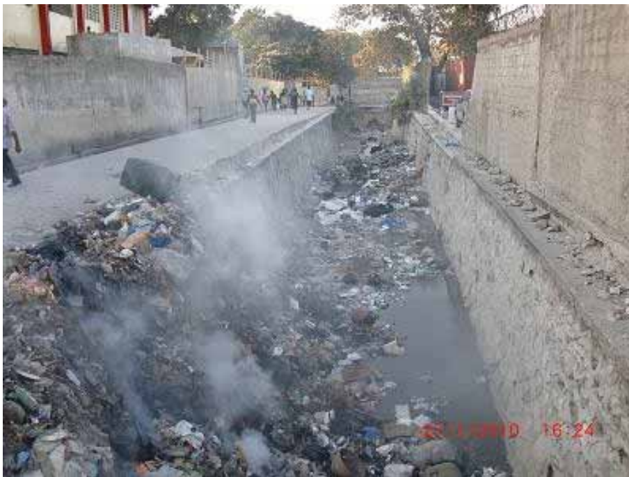
In many parts of Port-au-Prince, drainage channels are filled with solid waste. This causes localized flooding every time there is heavy rainfall.

In many parts of Port-au-Prince, the lack of municipal services for solid waste management has led to environmentally unacceptable situations. The worst example of these is the concrete drainage channel close to the main bus station in Carrefour, which is in many ways the most active part of the city, and one of the most economically important. The channel, which leads into the sea, is filled with garbage that has completely blocked the drain. In the event of heavy rains, the blockage causes the drain to flood, spreading the accumulated waste material throughout the crowded surrounding neighbourhood. Indicative of current relief efforts, the drain which was originally littered with remnants of urban life (plastic bags, tin cans, soft drink bottles, etc.) is now also full of the styrofoam packaging that is used to provide food supply to displaced communities.