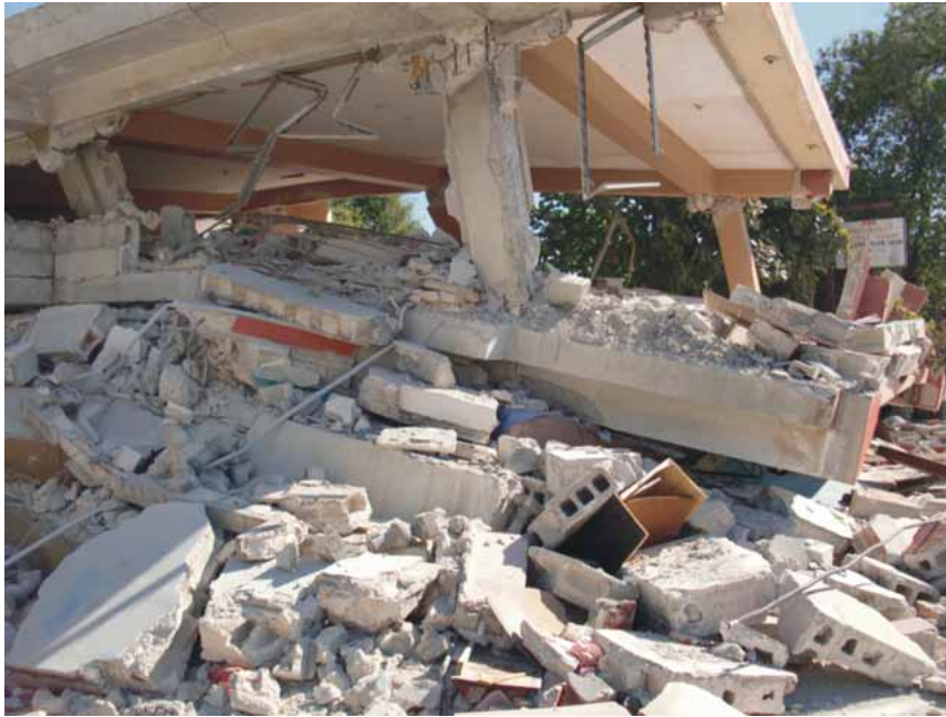
Concrete hollow bricks were often incorrectly used as load-carrying building material, and collapsed easily during the earthquake

Concrete is such a popular building material in Haiti that it is used in all new construction work – for walls, roofing, floors, compound walls and columns. A number of key advantages help to explain why it is preferred over wood: