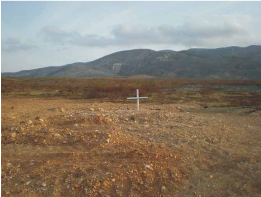
The remains of many victims were collected in trucks and disposed in hurriedly dug pits in Port-au-Prince and its environs.

It is important to note that even up to a month after the earthquake, it was not unusual to see dead bodies dumped along the roadside and in waste disposal piles. Some of these were collected and sent to mass burial sites, where they were buried in smaller pits. The situation concerning the disposal of victims is now more or less under control, although the same cannot be said about the bodies that were buried in mass graves.