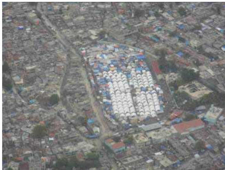
A densely populated IDP camp situated in the middle of Port-au-Prince. Although half a million people left the capital in the days following the earthquake, food distribution figures are increasing rather than shrinking.

It was also evident that in spite of the decisions taken in Port-au-Prince, there was hardly any UN or NGO presence in Gonaives to support those who had relocated there. While the Government had started a programme to register the displaced, it appeared as though the international relief apparatus still had no idea where people actually were.