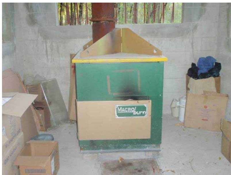
A number of hospital waste incinerators remained functional following the earthquake, aiding in medical waste management.

The mystery of the missing healthcare waste was partly solved when investigations were initiated to ascertain where the hospitals were disposing of their medical wastes. It came as a great relief when it was established that a number of these hospitals had incinerators which had remained functional throughout.