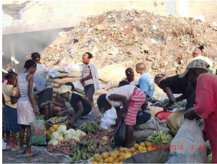
Vendors set up stalls all over Port-au-Prince, often within range of large uncollected waste piles.