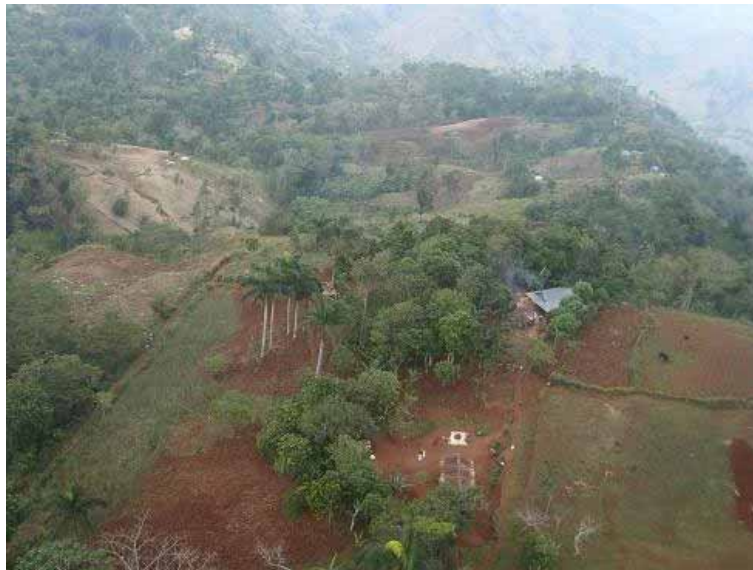
Significant soil erosion caused by deforestation reduces the ability of top soil to support vegetation.

With current knowledge about the chemistry and geology of the rocks and climatic factors, the following situation can be predicted with some certainty.