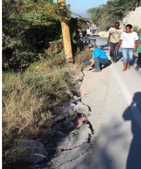
A UNEP expert inspects road damage in the days following the earthquake.

In 2009, working with the Government of Haiti, the William J. Clinton Foundation, the Earth Institute at Columbia University and various agencies of the United Nations, the UN Environment Programme (UNEP) formulated a comprehensive country-wide strategy known as the Haiti Regeneration Initiative (HRI), aimed at reducing poverty and disaster vulnerability in Haiti through the restoration of ecosystems and livelihoods based on sustainable natural resource management.