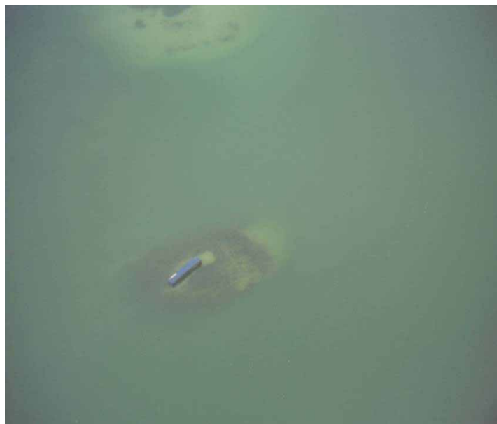
After the earthquake, a number of containers in the main port were washed out to sea, causing some concern for potential contamination.

into the sea. Fortunately, there is no indication so far that these containers contained any chemical or harmful substances.