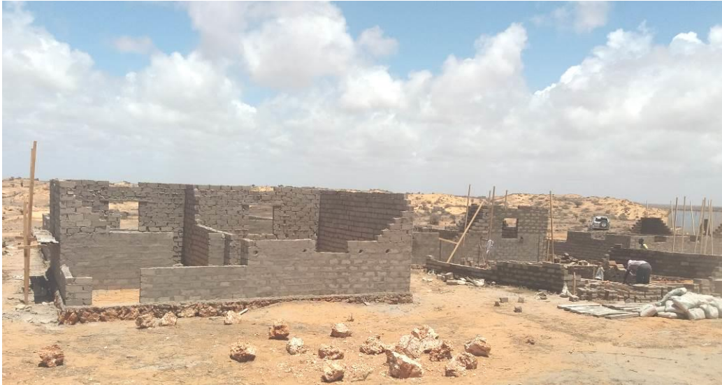
Ongoing construction of the final 100 shelters and 100 latrines in Kismayo.