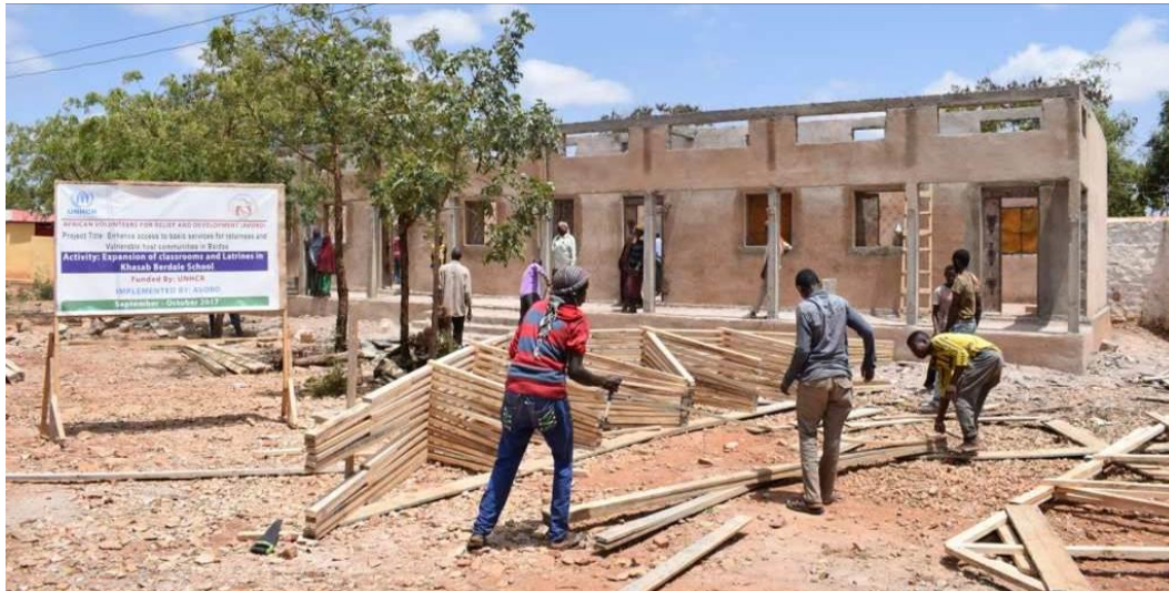
In September three classrooms and four latrines were constructed at a primary school in Baidoa. © UNHCR / Baidoa, September 2017