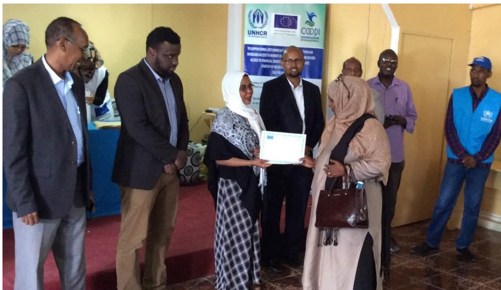
In Mogadishu 128 returnees and 32 IDPs graduated from the three months vocational trainings. © UNHCR / September 2017