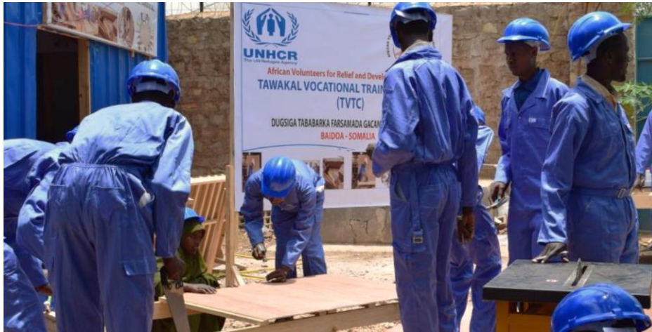
Returnees and members of host community in a workshop on carpentry obtaining new skills to be able to produce furnitures. © UNHCR / Baidoa, September 2017