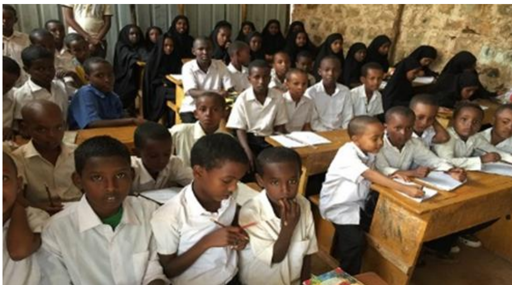
Newly enrolled children in Baidoa © UNHCR / September 2017