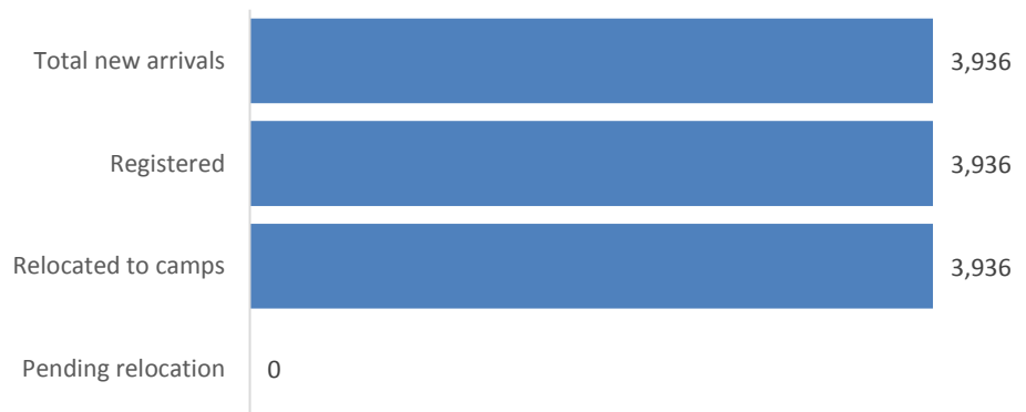
New arrivals since 1 January 2017

Special thanks to our partners at the Reception Centre: ARRA, IOM, IMC, MSF, NRC, SCI, UNFPA, WFP