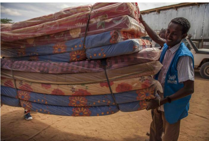
UNHCR and partners strive to provide the necessary support to new arrivals, including Non-Food Items.

United Nations High Commissioner for Refugees (UNHCR) – www.unhcr.org