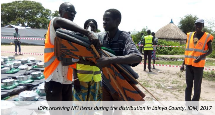
IDPs receiving NFI items during the distribution in Lainya County.