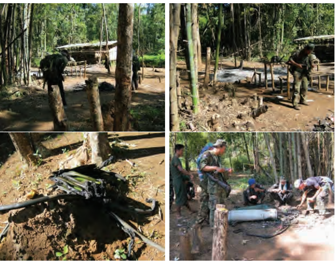
These four photos, taken in December 2010, show KNLA soldiers de-activating and removing a landmine in Kyaw Pyah village tract, Mone Township, Nyaunglebin District, which was placed by Tatmadaw LIB #599 and IB #48 soldiers, after they patrolled in the area and burnt down a KNLA camp.