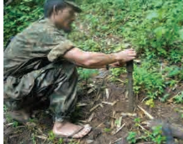
The photo above left shows a Burmese-made MM-1 stake fragmentation mine planted in Saw Muh Bplaw village tract, Lu Thaw Township, Papun District. This type of mine is mounted above-ground on a stake to maximise destructive effect, and is often rigged to a tripwire, which can be easily hidden on an overgrown forest footpath. In the photo at right a KNDO soldier is de-activating and removing the mine. These photos were taken in early October 2011.