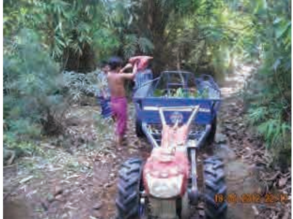
The photos above, taken on April 18th 2012, show a cow in the forest between Htee Klay Kee and Kaw Toe villages in Htee Klay village tract, T'Nay Hsah Township, Pa'an District that stepped on a landmine on the same day that these photos were taken by a community member working with KHRG. As is visible in the photos above, the cow's two forelegs were both destroyed. The cow's owner (wearing the purple longvi) killed the cow and then the men butchered it and carried the meat to their hand tractor. 81