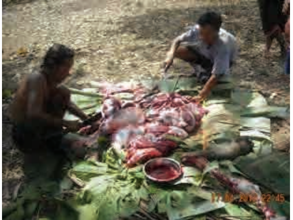
The photos above, taken on April 17<sup>th</sup> 2012 in Htee Klay village tract, T'Nay Hsah Township, Pa'an District show a cow being butchered after stepping on a landmine that same day; the owner of the cow is holding the cow's dismembered leg in the photo at left. Since the beginning of 2012, residents of only one village in Htee Klay village tract recorded a total of 17 livestock animals injured by landmines, and five human casualties, including one who subsequently killed himself.<sup>80</sup>

<sup>79</sup> For the previously unpublished testimony of Saw Hn--- that was received by KHRG in May 2012, see Section III: Source Document: 2012/March/Pa'an/1.