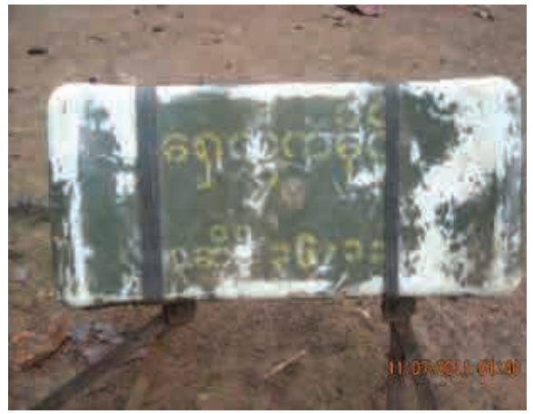
The four photos above, taken in July 2011, show factory-produced command-detonated claymore mines; the community member who took these photos reported that these mines were provided by the Tatmadaw to Border Guard Battalion #1015, which planted the mines near the gate of Battalion #1015 camp at R---. In the photos above, the Burmese inscription 'yan thu bet' translates as 'enemy side' or 'side facing enemy'; in the photos below, the inscription 'shay twet maing a saing 36/11' means 'forward-exploding' or 'directional' mine with a width of 36/11. <sup>47</sup>