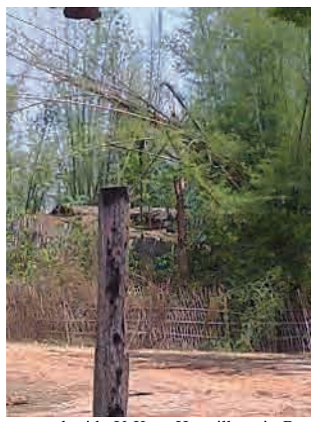
The photos above, taken in March 2012, show the Tatmadaw camp beside U Kray Hta village in Dooplaya District and three bulldozers parked in front of the camp. These three bulldozers were used to clear landmines planted in U Kray Hta village and on the vehicle road. According to the community member working with KHRG who took these photos, the clearing of the landmines was not systematic or complete, and at least some landmines still remain in and around the village, including in the U Kray Hta school compound. The vehicle road from which some mines were cleared by the bulldozers is visible in the foreground in both photos. <sup>129</sup>