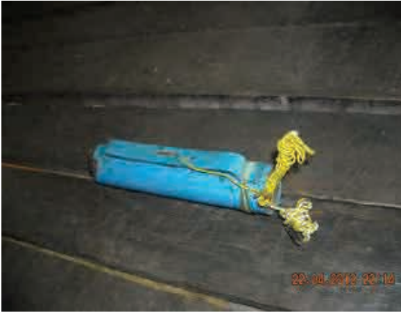
The photo above left shows a landmine removed and destroyed by Thee Wah villagers in April 2012 in response to threats to local villagers and livestock. According to the community member working with KHRG who took these photos, Thee Wah villagers dug out this mine, and approximately 20 others, using a long stick wherever they saw a mound of freshly-turned earth. They then deactivated the mine by removing the wire and cutting off the cap with a machete to remove the gunpowder inside, which was used to make homemade bombs attached to a remote-detonation device for use during fishing. The gunpowder removed from the landmine is being stored inside the blue plastic bag (above left). The photo at right shows a landmine of the type planted by Tatmadaw Border Guard troops in T'Nay Hsah Townhip that was removed by Tatmadaw Border Guard soldiers at the request of local villagers in March 2012, along with about 20 or 30 others, before a soldier was injured by a landmine and plans to remove the mines were abandoned. In the photo above right, the detonation trigger button is visible in the middle of the mine. [128]