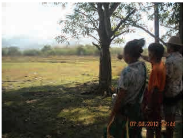
The photo above left shows two male villagers from Noh Kay village tract, one of whom was injured in 2005 (left) and one of whom was injured in 2010 (centre). The woman on the right, Ma Nu---, 33, stepped on a landmine near Noh Kyaw village while she was looking for firewood. In the photo at right, all three villagers are indicating an area near Thee Wah village that continues to be contaminated by mines. [127]