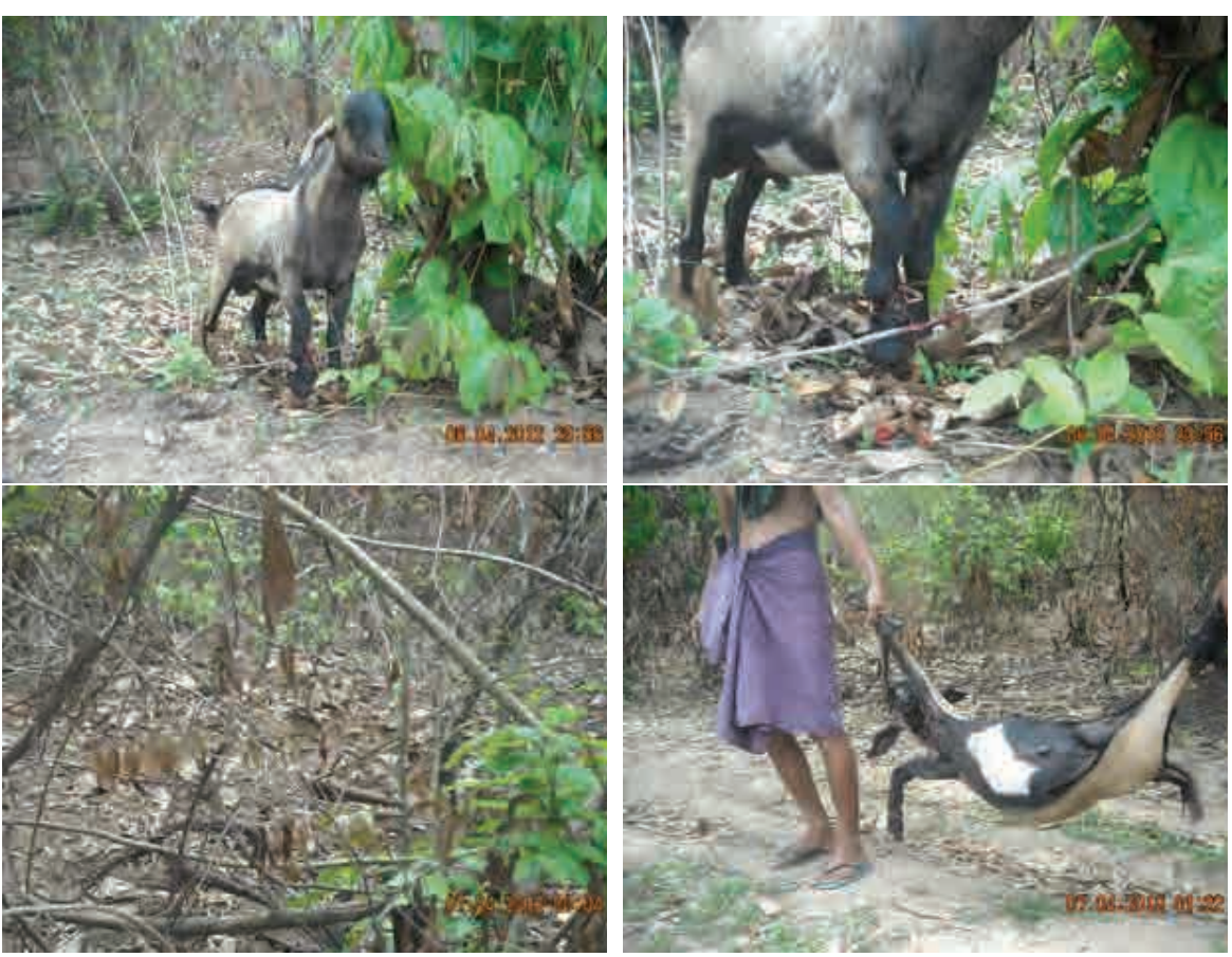
The top photos above show a goat injured by a landmine near Thee Wah village in Noh Kay village tract on April 6^{th} 2012. In the photo below right, the man carrying the goat on the right (only left hand visible) is the owner. According to the community member working with KHRG who accompanied these men and took these photographs, the goat owner has already previously lost one goat and one cow in the same area because of landmines. The photograph below left shows the mined area, which is covered with dry leaves. The community member who took these photos said that when the three men walked here, they swept the ground in front of them with a long stick.