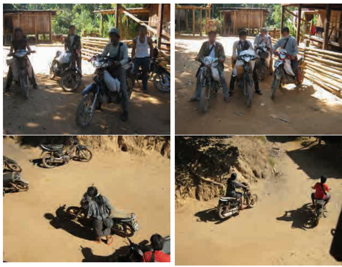
The four photos above taken in November 2011 in Tantabin Township, Toungoo District, show motorcycle drivers who had to transport supplies and equipment to support Tatmadaw MOC #9 road-building activities using their own motorcycles. According to the community member working with KHRG who took these photos, the motorcycles were ordered to drive in front of the bulldozer in areas suspected to be mined during the construction of the new vehicle road from Kaw Thay Der to Naw Soe, leading the motorcycle drivers to suspect they were being used to clear landmines from the intended course of the new road.