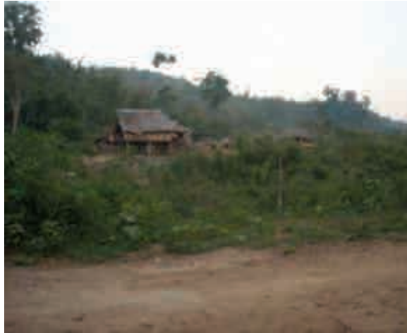
These pictures, taken on April 8th 2011, show Khaw Klaw village, which is located beside the Meh Gkleh Law River. The researcher who took these photos reported that villagers living in areas adjacent to the Meh Gkleh Law River were relocated to Khaw Klaw village on the Meh Gkleh Law riverbank after August 2010, when the DKBA commenced gold-mining activities in the river. Even though the DKBA mining operation in the Meh Gkleh Law River is no longer active, landmines laid in their original village mean that they have not been able to return, and continue living in Khaw Klaw. 85