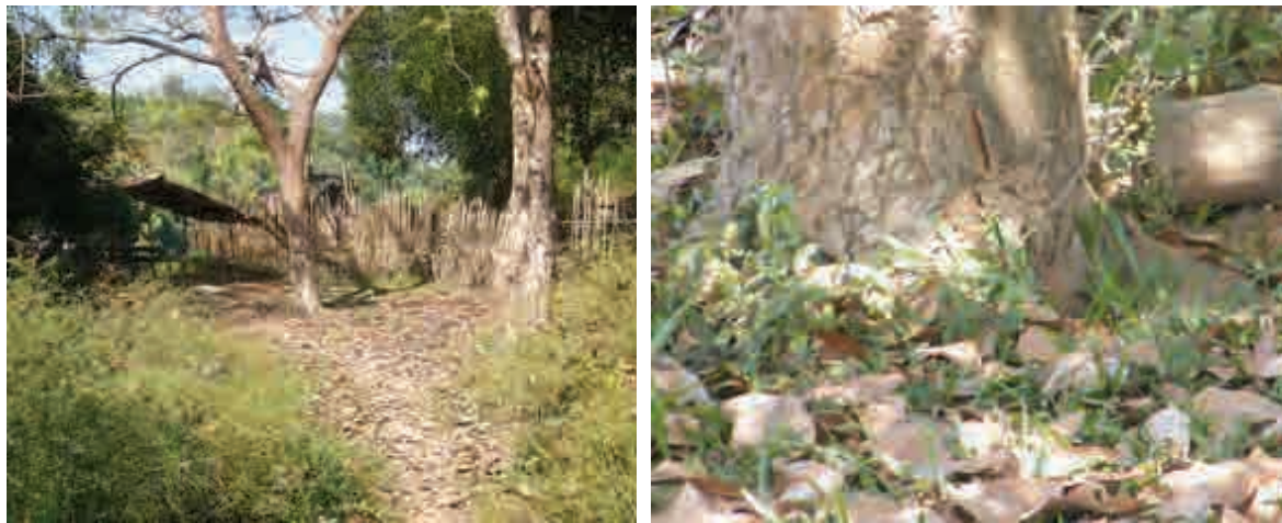
The two photos above, were taken on January 15<sup>th</sup> 2011 in Ca--- village, Meh Mweh village tract, Bu Tho Township, Papun District. According to the community member working with KHRG who took these photos, former-DKBA #777 soldiers previously based in Ca--- left the village when they transformed to Tatmadaw Border Guard battalions, but did not remove the landmines that they had previously planted. The photos above show the site at which a landmine detonated, hitting two buffalos belonging to Ca--- villagers. <sup>83</sup>