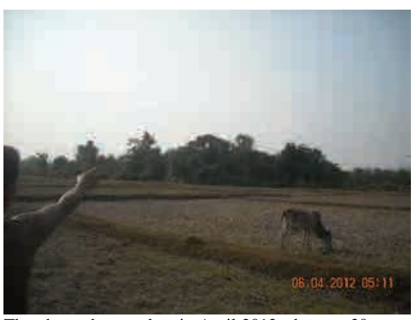
The photo above, taken in April 2012, shows a 30-year-old farmer in Noh Kay village tract, T'Nay Hsah Township, Pa'an District indicating the areas near Thaw Waw village where landmines were planted by Tatmadaw Border Guard and KNLA troops during 2011. <sup>14</sup>/ Photo: KHRG /

Despite the inherent difficulties in identifying perpetrators responsible for planting mines, information received from Thaton, Toungoo, Tenasserim, Papun, Dooplaya and Pa'an districts indicated that government forces stationed there during the reporting period deployed new landmines.<sup>15</sup>