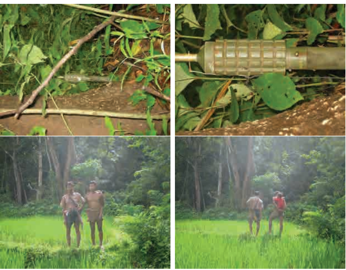
These four photos were taken in September 2011 in Bu Tho Township, Papun District. The top photos show a Burmese-made MM-1 stake fragmentation mine planted beside a flat field paddy farm, close to Boh Hta village. According to a Boh Hta village representative, the landmine was planted by Tatmadaw LIB #240 soldiers during September 2011. The owners of the flat field next to which the mine was planted (shown in the bottom two photos with a child) told the community member who took these photos that they worried that their cows and buffalos would step on the mine and, as a result, had to keep an especially close watch on them. 44