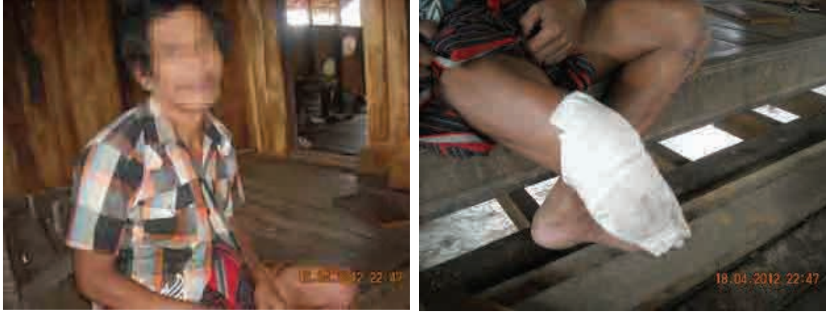
The photo above left shows Da---, 51, from Noh Kay village tract. He stepped on a landmine planted in between Htee Klay Kee and Kaw Toe villages in January 2012 while he was looking for food to feed his pig. <sup>200</sup>

<sup>199</sup> For this previously unpublished interview see Section III: Source Document: 2011/December/Pa'an/2.