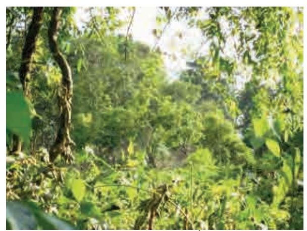
This photo, taken on October 16<sup>th</sup> 2011, shows the Tatmadaw camp at Yo Kla in Bilin Township, Thaton District (centre). According to the community member who took this photo, villagers are afraid to look for firewood close to the camp because the Tatmadaw soldiers plant unmarked landmines around the camp for their security. <sup>86</sup>

"The one [Border Guard soldier] who came back said that he planted 300 landmines. He told many people. At first, I didn't believe. His brother said that he asked him and it was really 300 landmines. I want to tell the one who came and planted the landmines to take of all the landmines back then we can do farming by using cows or buffalo."