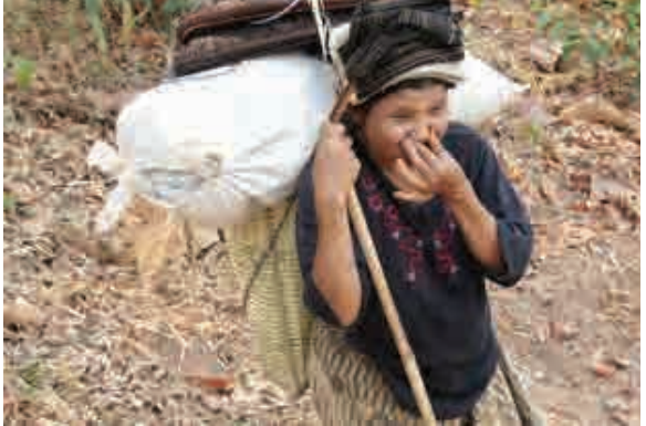
This photo, taken in March 2012 shows the area next to the Maw Thay Der mountain path in Toungoo District (left, see also front cover photo) that is contaminated with an unknown number of landmines after a KNLA ambush of Tatmadaw troops (see cover photo) here. According to a local community member, the mines are planted in the area to the left of the path and are hidden underneath the leaves. The photo at right shows a local woman travelling along the path carrying betelnuts back from her plantation. 82