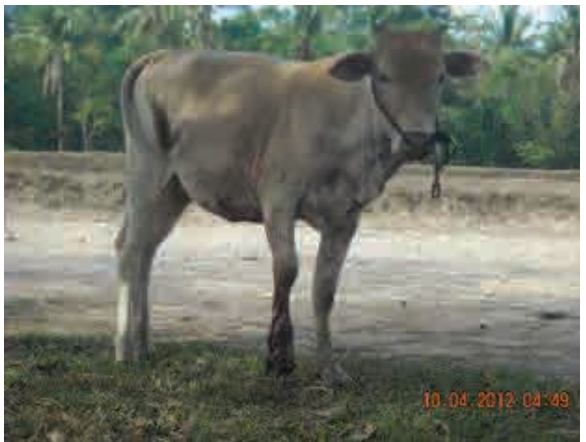
The photo above left, taken on April 10<sup>th</sup> 2012, shows a site near Thaw Waw Thaw village in Noh Kay village tract, T'Nay Hsah Township, Pa'an District where Saw Hn--- stepped on a landmine while going fishing. On the same day that these photos were taken, the cow (above right) stepped on another landmine within twenty feet of the location where Saw Hn--- was injured. <sup>79</sup>