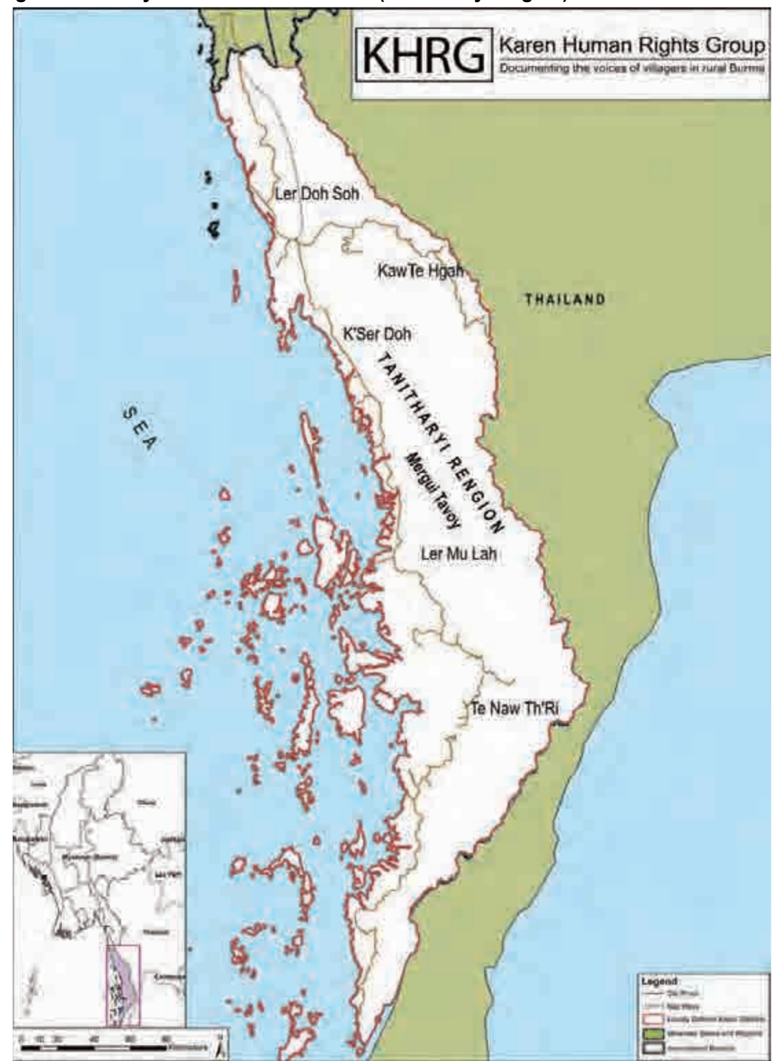
Figure 2: Locally-defined Karen districts (Tanintharyi Region)