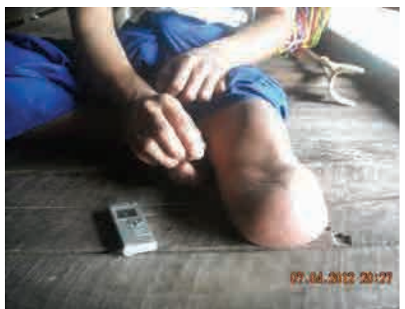
The photo above left shows Wh--- from Noh Kay village tract who was injured in November 2011 by a landmine planted near his paddy field.