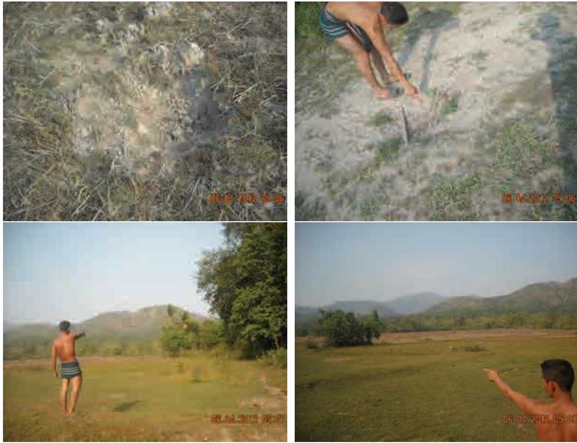
The photos above show a 30-year-old farmer in Thaw Waw Thaw village, Noh Kay village tract indicating the site where a landmine exploded on March 8<sup>th</sup> 2012 (top) injuring a cow, and the areas near Thaw Waw Thaw village where villagers are afraid to travel for fear of stepping on landmines. 37 villagers from Thaw Waw Thaw village provided their names to KHRG and requested that KHRG publish their urgent request for mine-removal. <sup>43</sup>

Situation update written by a community member in Bu Tho Township, Papun District (Received August 2011)<sup>42</sup>