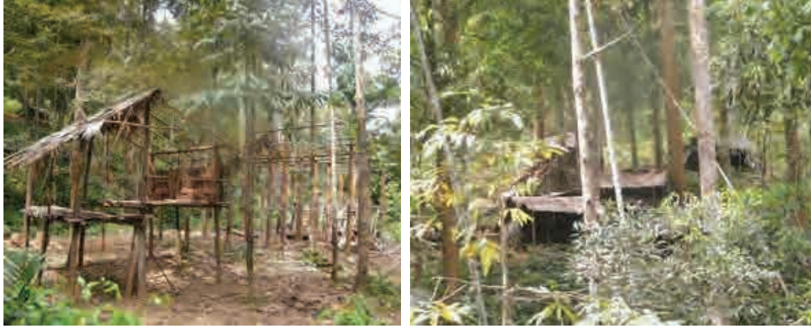
These photos, taken on March 11<sup>th</sup> and 12<sup>th</sup> 2011, show abandoned former-DKBA #777 sentry huts (left) and camp (right) in Meh Mweh village tract, Bu Tho Township, Papun District. According to the community member working with KHRG who took these photos, starting from early 2011 following the transformation of DKBA #777 to Tatmadaw Border Guard Battalions, the soldiers left the camp and have not come back again. However, landmines previously planted around the camp were not removed when the soldiers left the area.