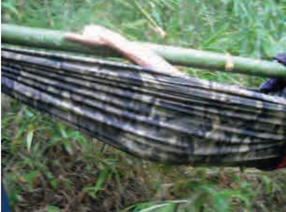
The photos above were taken on September 11th 2011. They show villagers in Lu Thaw Township crossing the Kyaukkyi - Saw Hta vehicle road, while carrying a 45-year-old Am--- villager named Saw Mu--- who stepped on a landmine near his hill field in Hee Oo Htaw on August 30<sup>th</sup> 2011, at approximately 1:50 pm. <sup>208</sup>