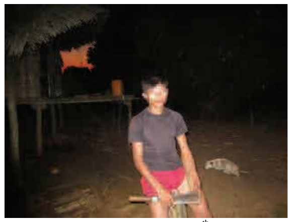
This photo, taken on November 30<sup>th</sup> 2011, shows Saw Br---, a 30-year-old No--- villager from Day Wah village tract, Bu Tho Township, Papun District who was forced to carry Tatmadaw LIB #218 soldiers killed or injured by landmines during November 2011. <sup>132</sup>

Saw Pa--- (male, 29), Pl--- village, Than Daung Township, Toungoo District (Interviewed December 2010)<sup>134</sup>