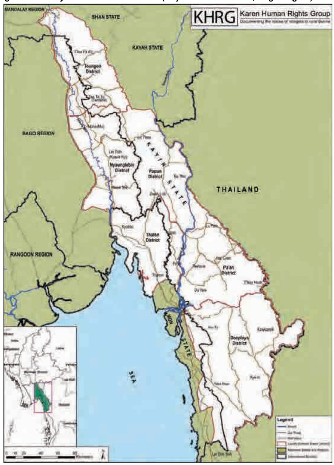
Figure 1: Locally-defined Karen districts (Kayin and Mon states; Bago Region)