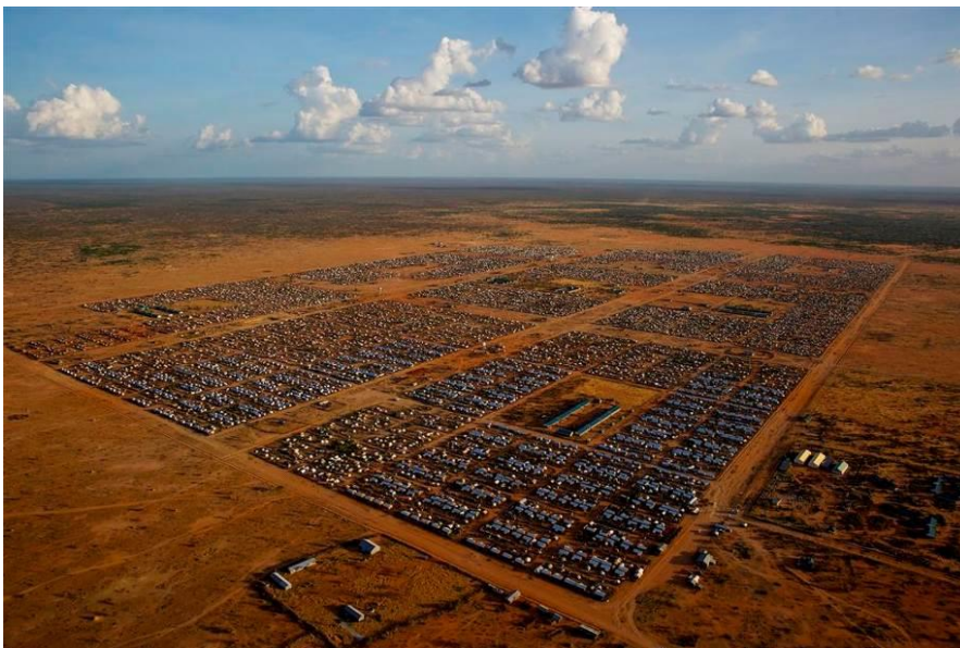
Ifo 2 aerial view

Ifo 2 has a refugee leadership structure comprising of a chairman, chairlady, 34 section leaders (17 men and 17 women) and 236 block leaders (118 men and 118 women) who were democratically elected by the residents in a general election in August 2013. Women's participation in decision making is generally poor due to strong cultural traditions but has improved after numerous training sessions in leadership skills. Leaders were also trained on roles and responsibilities and are guided by a formal Code of Conduct.