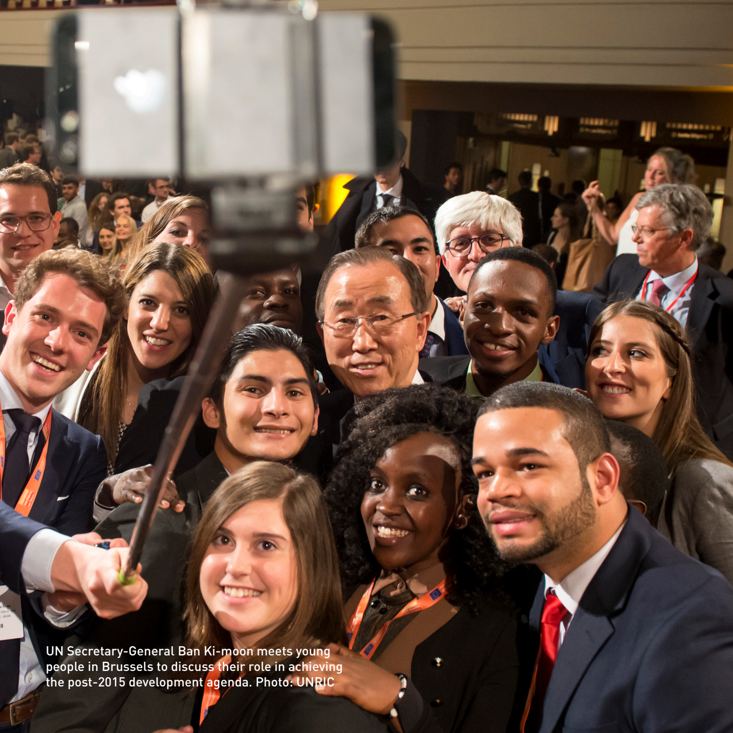
UN Secretary-General Ban Ki-moon meets young people in Brussels to discuss their role in achieving the post-2015 development agenda.