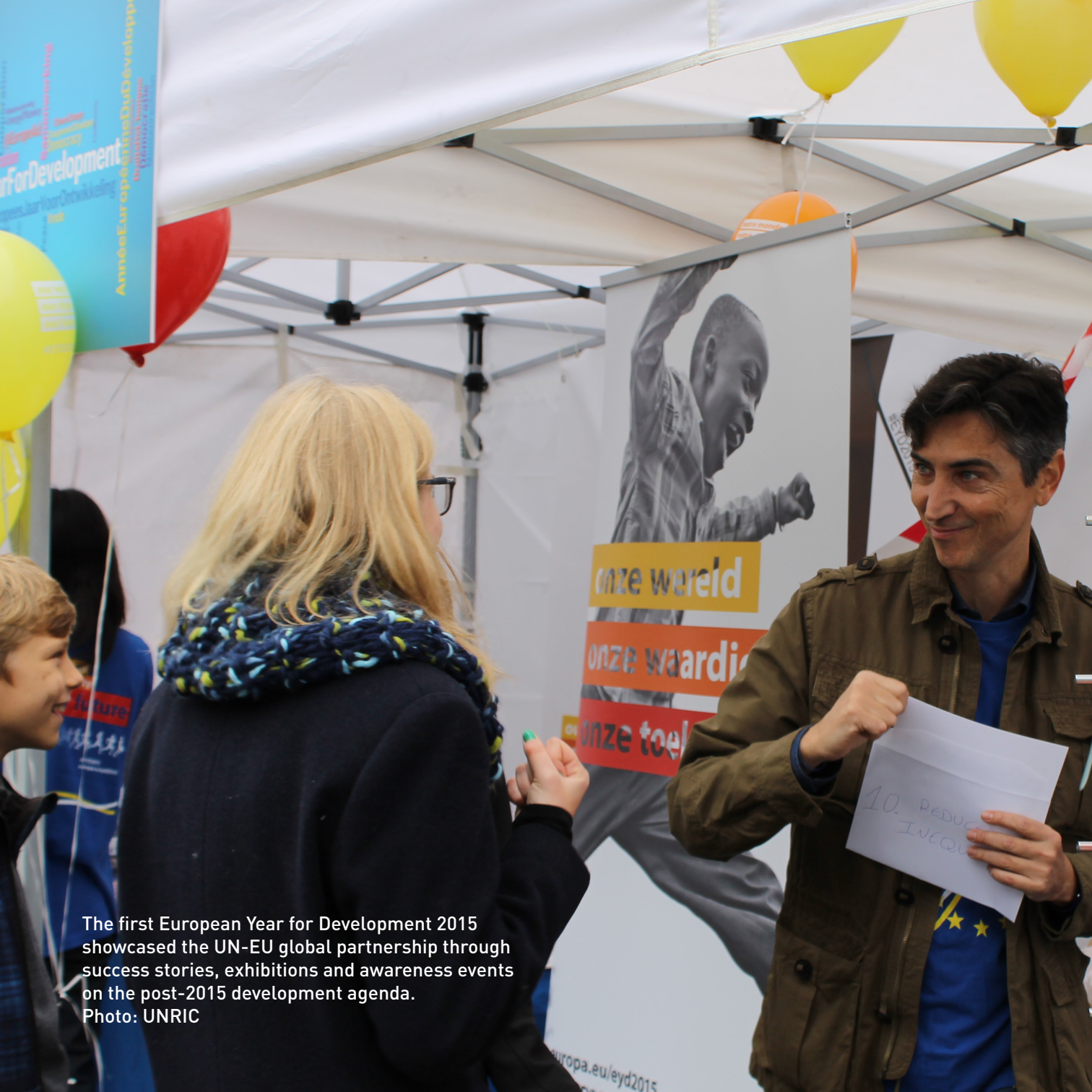
The first European Year for Development 2015 showcased the UN-EU global partnership through success stories, exhibitions and awareness events on the post-2015 development agenda.