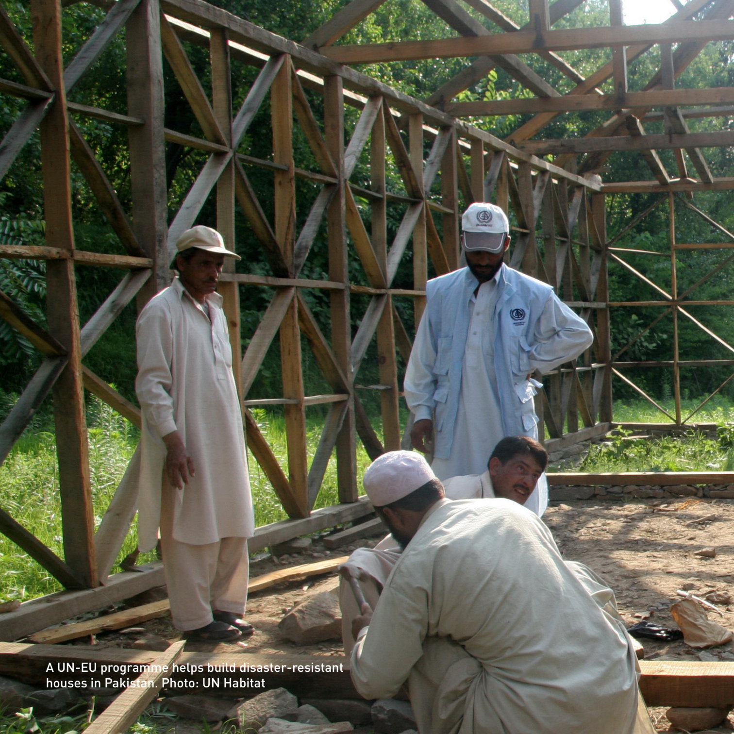
A UN-EU programme helps build disaster-resistant houses in Pakistan.