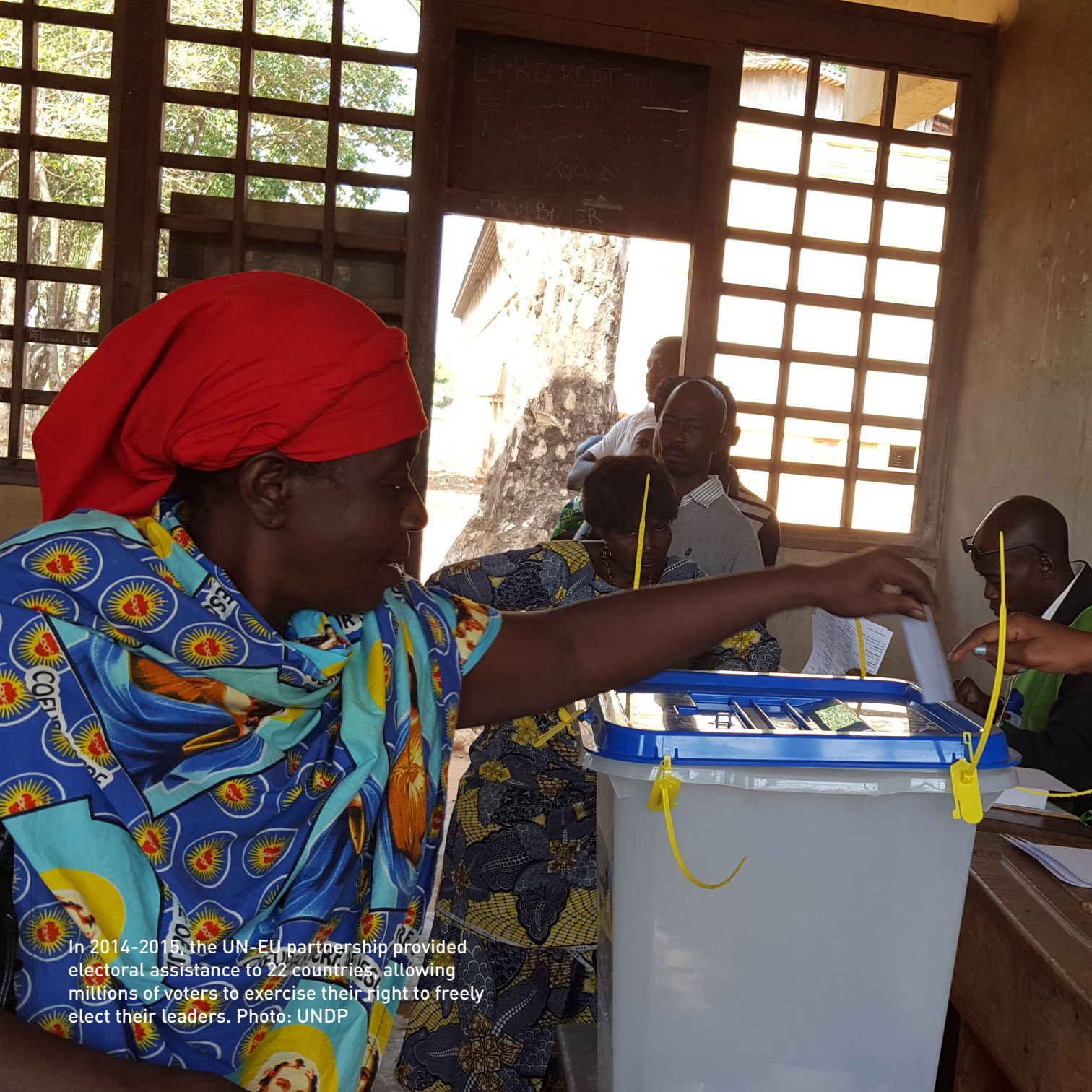
In 2014-2015, the UN-EU partnership provided electoral assistance to 22 countries, allowing millions of voters to exercise their right to freely elect their leaders.