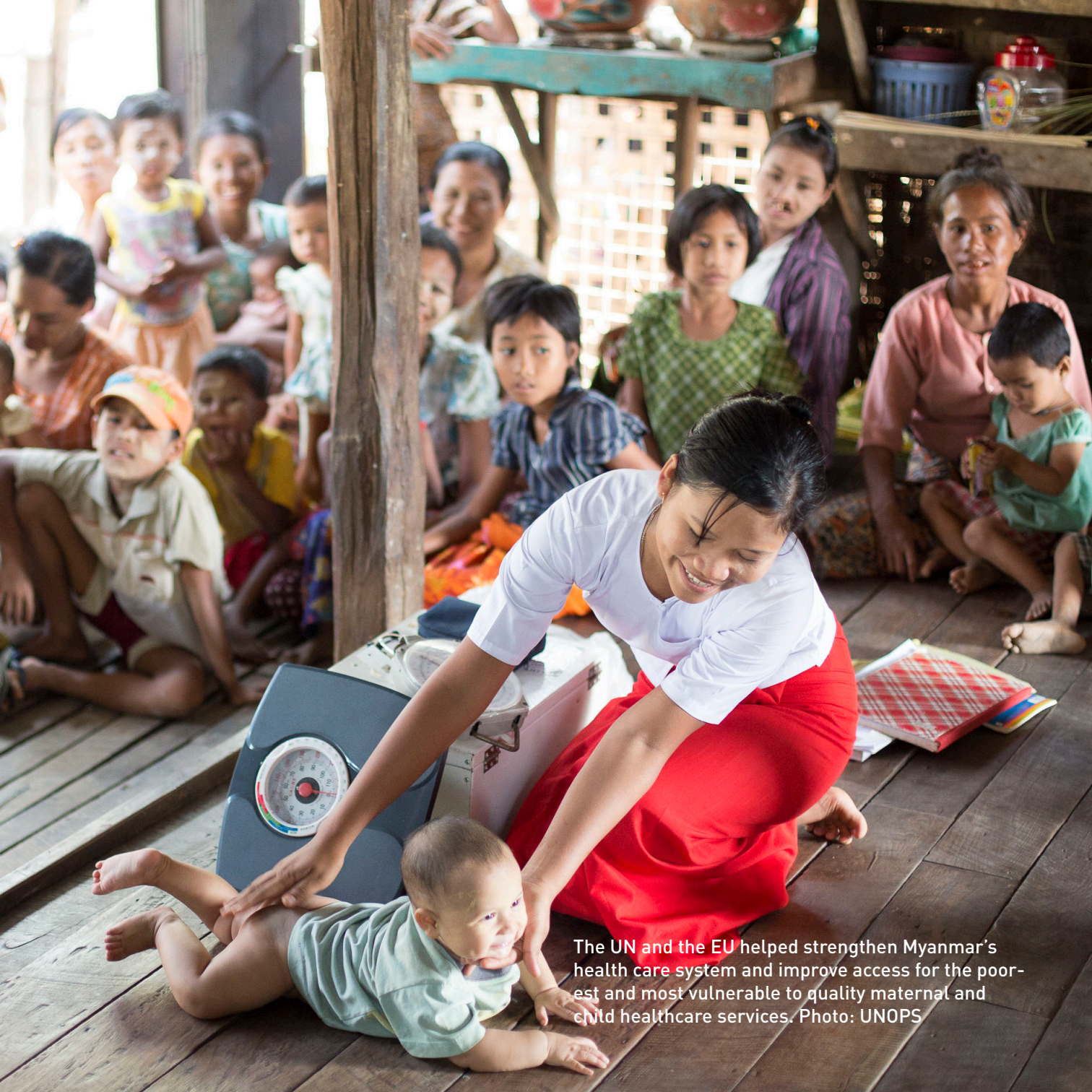
The UN and the EU helped strengthen Myanmar's health care system and improve access for the poorest and most vulnerable to quality maternal and child healthcare services.