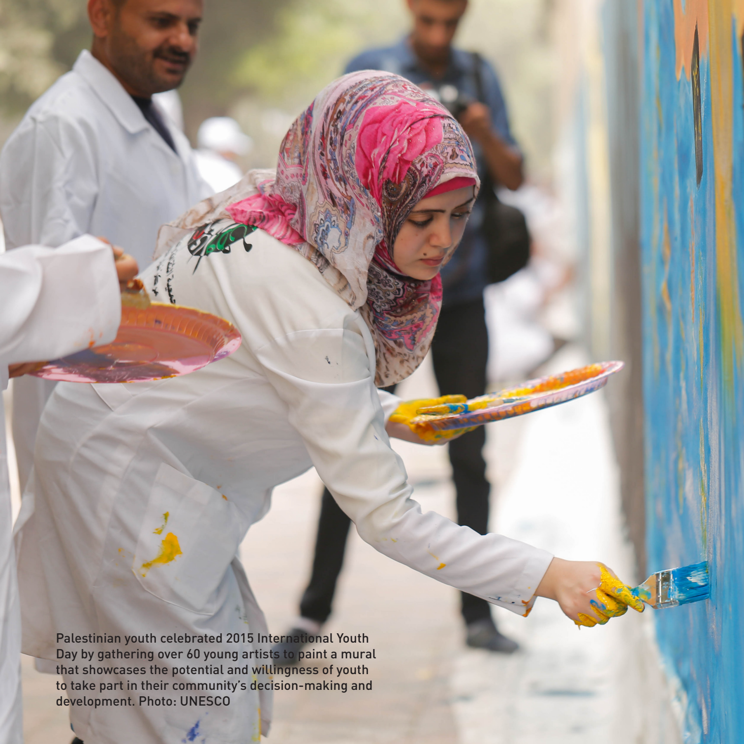
Palestinian youth celebrated 2015 International Youth Day by gathering over 60 young artists to paint a mural that showcases the potential and willingness of youth to take part in their community's decision-making and development.