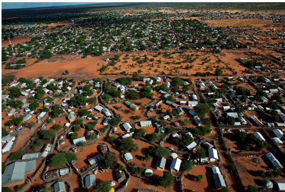
Hagadera from the air

Livelihoods support includes tailoring, shoe making, soap making, weaving and sewing, tie and dye. The refugee community has a strong interest in projects on income generating activities to enable them to sustain themselves. There is growing need to increase support on livelihood projects.