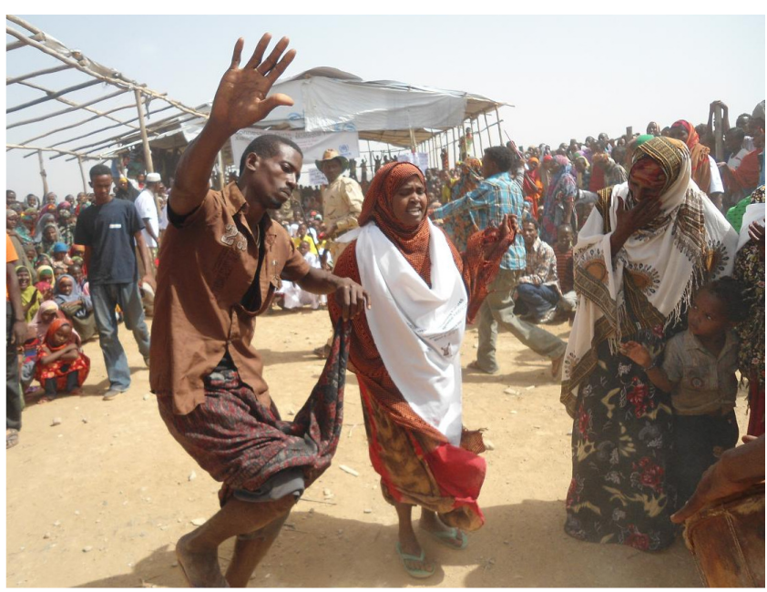
BOKOLOMANYO REFUGEES PERFORMING TRADITIONAL DANCE WORLD REFUGEE DAY 2012.