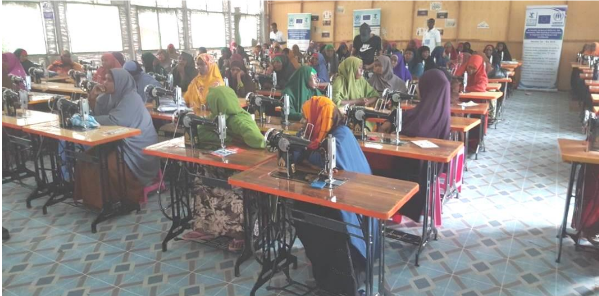
A vocational training in tailoring, targeting 100 women (42 returnees, 45 IDPs and 13 members of the host community) in Mogadishu.