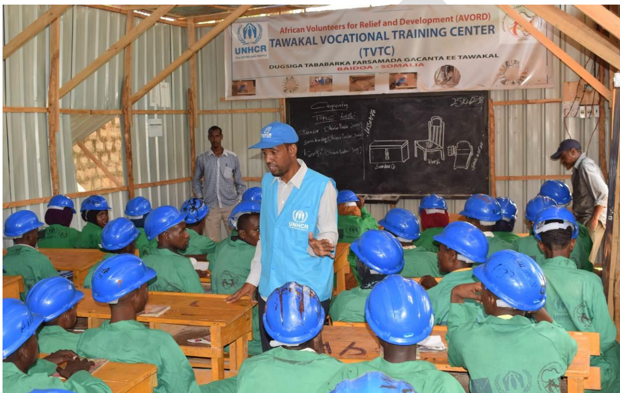
A group of 60 Somalis (30 returnees, 24 displaced persons and six members of host community members) in a class on carpentry in Baidoa. The group finished third month of the trainings, theory and practice.