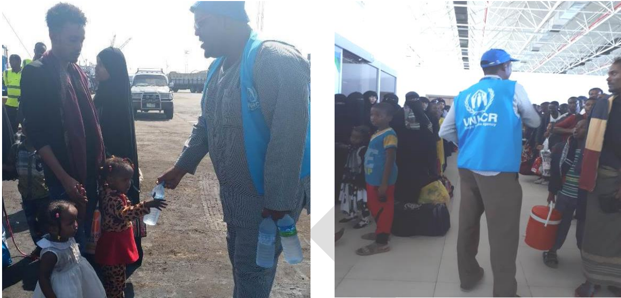
UNHCR receiving Somali refugee returnees from Yemen at the port of Berbera (left) and at the airport in Mogadishu (right).

During April, Somali refugees have repatriated by air (from Kenya) and sea (from Yemen). Road convoys from Kenya remain suspended as roads are impassable due to the Gu rains. The last road convoy was received on 14 March.