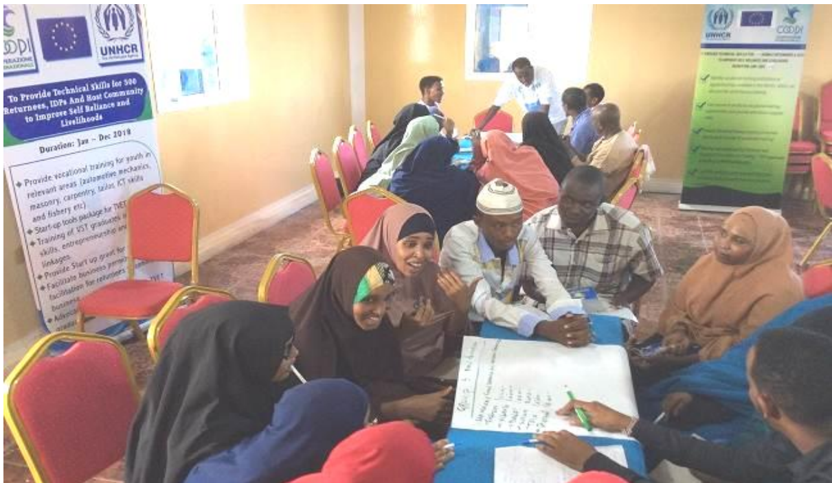
A group of 100 persons (43 returnees, 14 IDPs and 43 members of the host community) started with training to establish their own business. © UNHCR/April 2018