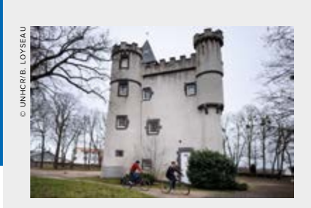
In 2015, Pessat-Villeneuve, which has a population of 550, opened the doors of its château as a reception and guidance centre for refugees from Calais and Paris. Since then, it has hosted 136 refugees.

entitled to it, notably in Southeast Europe. Procedures to identify and protect stateless persons are being developed and strengthened throughout Europe, notably in relation to the adequate recording of statelessness among refugees and migrants arriving in Europe. UNHCR seeks to engage the different EU institutions that can play a role in this regard, notably EASO and Frontex. Cooperation with the OSCE, initiated with the publication of the joint UNHCR-OSCE "Handbook on statelessness in the OSCE area: international standards and good practices" will continue throughout the region, notably in Southeast and Eastern Europe. UNHCR's fruitful collaboration with the European Network on Statelessness will continue in 2018 in a number of thematic areas, regionally and nationally.