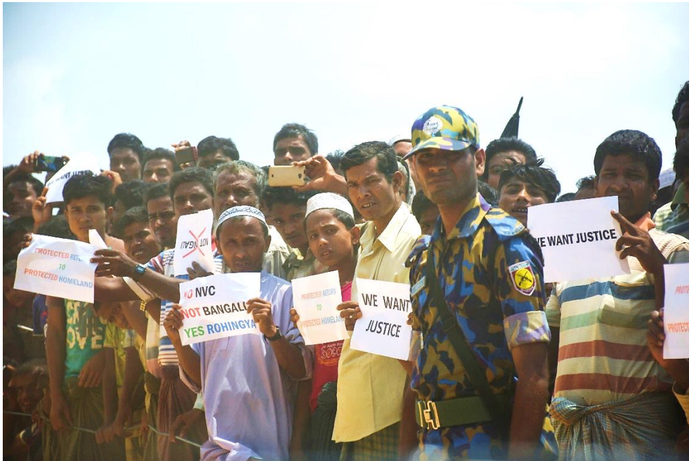
Thousands of Rohingya refugees line the roads of the Kutupalong mega refugee settlement as the UNSC visit takes place. Many hold signs welcoming the visit and saying they want justice, as well as stating their key demands for repatriation.

Myanmar unless questions of citizenship, legal rights, access to services, justice, and restitution are addressed.