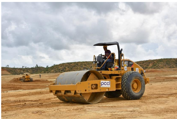
Machinery seen in the new land where UNHCR and IOM will start relocating refugee families once shelters and facilities have been established.

New land: The first portion of the newly allocated land, comprising approximately 12 acres, has been leveled and is now ready for UNHCR and partners to install shelters and facilities for safe relocations. This is part of new land that was allocated by the Government of Bangladesh in north-western Kutupalong settlement to accommodate refugees being relocated from high risk flood and landslide areas. It is envisioned that the total of all the new land under development (approximately 100 acres) should be able to provide homes for another 12-15,000 individuals. As part of a tripartite earthworks project with IOM, UNHCR,