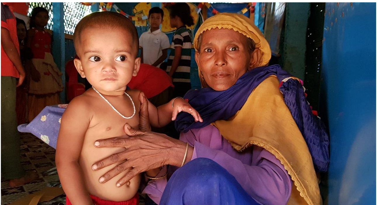
A child and a woman wait at a play area inside a nutrition center run by UNHCR partner Action Against Hunger (ACF)