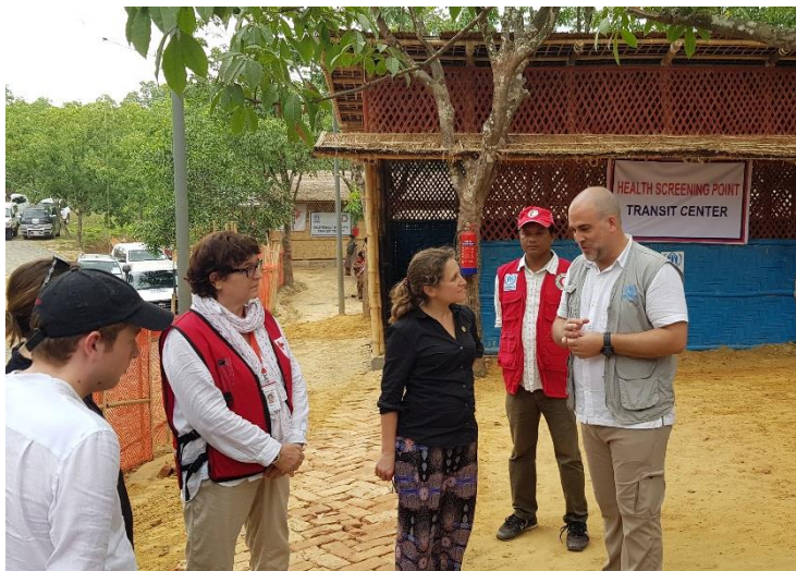
Canada's Foreign Minister Chrystia Freeland is briefed by UNHCR Head of Operation during her visit to UNHCR's Transit Center in Kutupalong.

Last month, UNHCR and the Government of Bangladesh signed a Memorandum of Understanding (MoU) relating to voluntary returns of Rohingya refugees once conditions in Myanmar are conducive. The MOU establishes a framework of cooperation between UNHCR and Bangladesh on the safe, voluntary, and dignified returns of refugees in line with international standards.