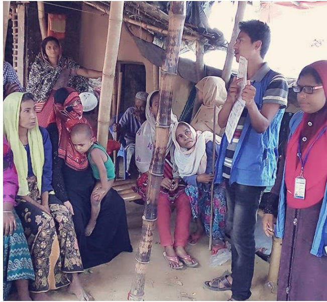
Refugee community volunteers deliver awareness raising messages on cyclone and monsoon preparedness across all settlements.

Health and Nutrition: With the support of UNHCR, UNICEF, and the Swedish International Development Cooperation Agency (SIDA), UNHCR and partner Action Against Hunger (ACF) launched a follow up emergency survey to determine the health and nutrition status among refugees. Starting on 28 April 2018, around 715 out of a sample population of 1,806 households were already surveyed, and while data collection is still ongoing in both Kutupalong and Nayapara, the survey results are expected to be completed by the second week of June 2018. The modules covered in the survey are child anthropometric and health, infant and young child feeding (IYCF), mortality and immunization coverage.