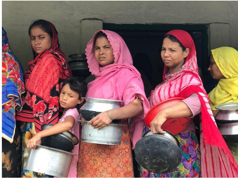
Newly arrived Rohingya refugees at UNHCR's Transit Center queue up for a hot meal, provided twice daily by UNHCR partner ACF and cooked at the center's community kitchen.

Since the start of January 2018, over 8,441 refugees have arrived in Bangladesh, with over 450 individuals arriving in the last two weeks 1 . Travelling from Myanmar by boat, refugees continue to cross the border into Bangladesh, particularly through the Sabrang arrival point. The Bangladesh Army, UNHCR, and partners have maintained basic services at the arrival point for new arrivals, which include health and food, to support the refugees who have undertaken difficult journeys with limited supplies. Many new arrivals report having left Myanmar without relatives, some of whom reportedly plan to leave soon due to continued fear for their security and safety.