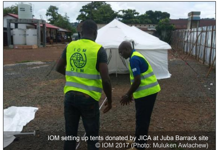
IOM setting up tents donated by JICA at Juba Barrack site © IOM 2017 (Photo: Muluken Awlachev)