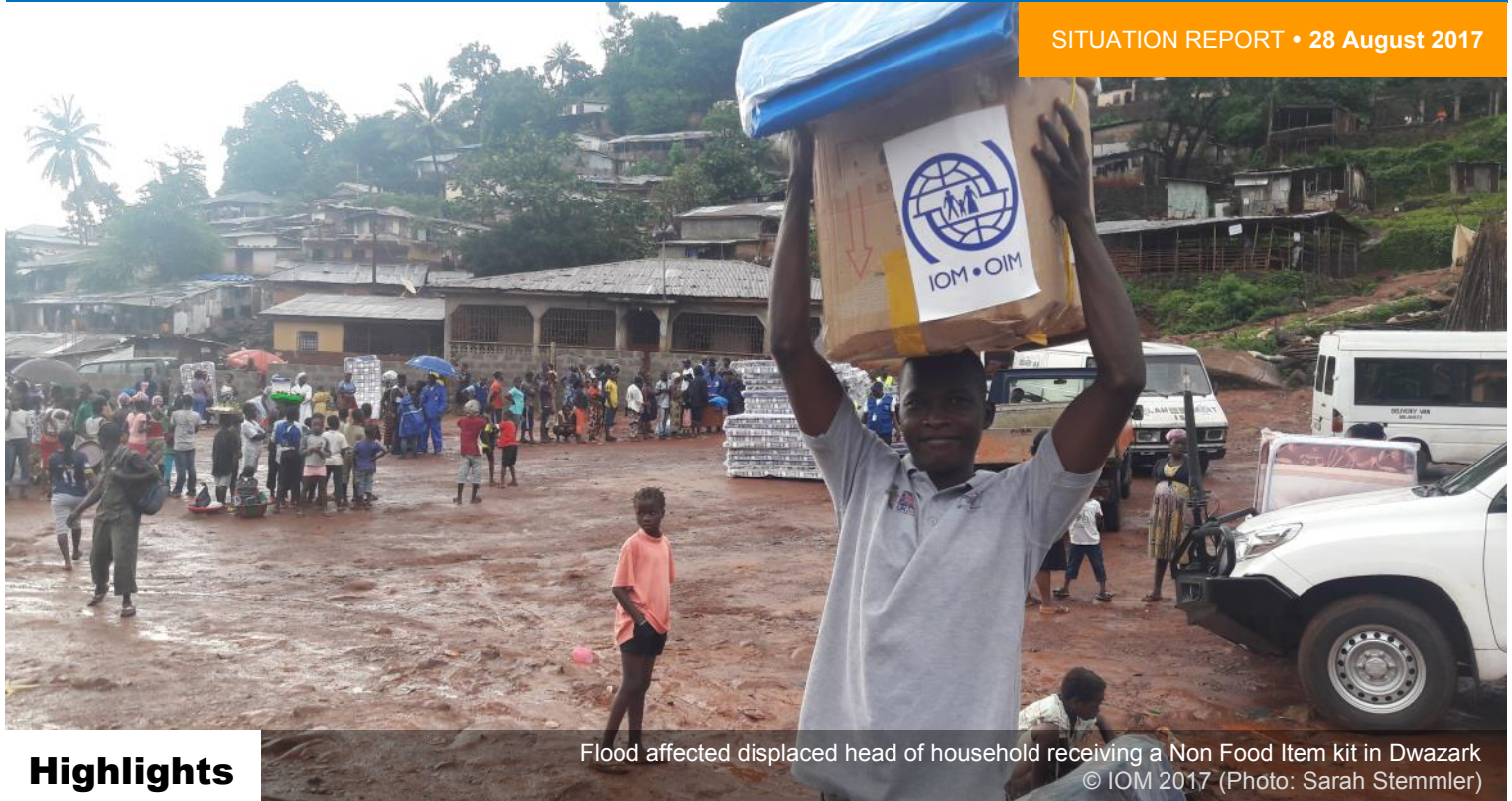
Flood affected displaced head of household receiving a Non Food Item kit in Dwazark