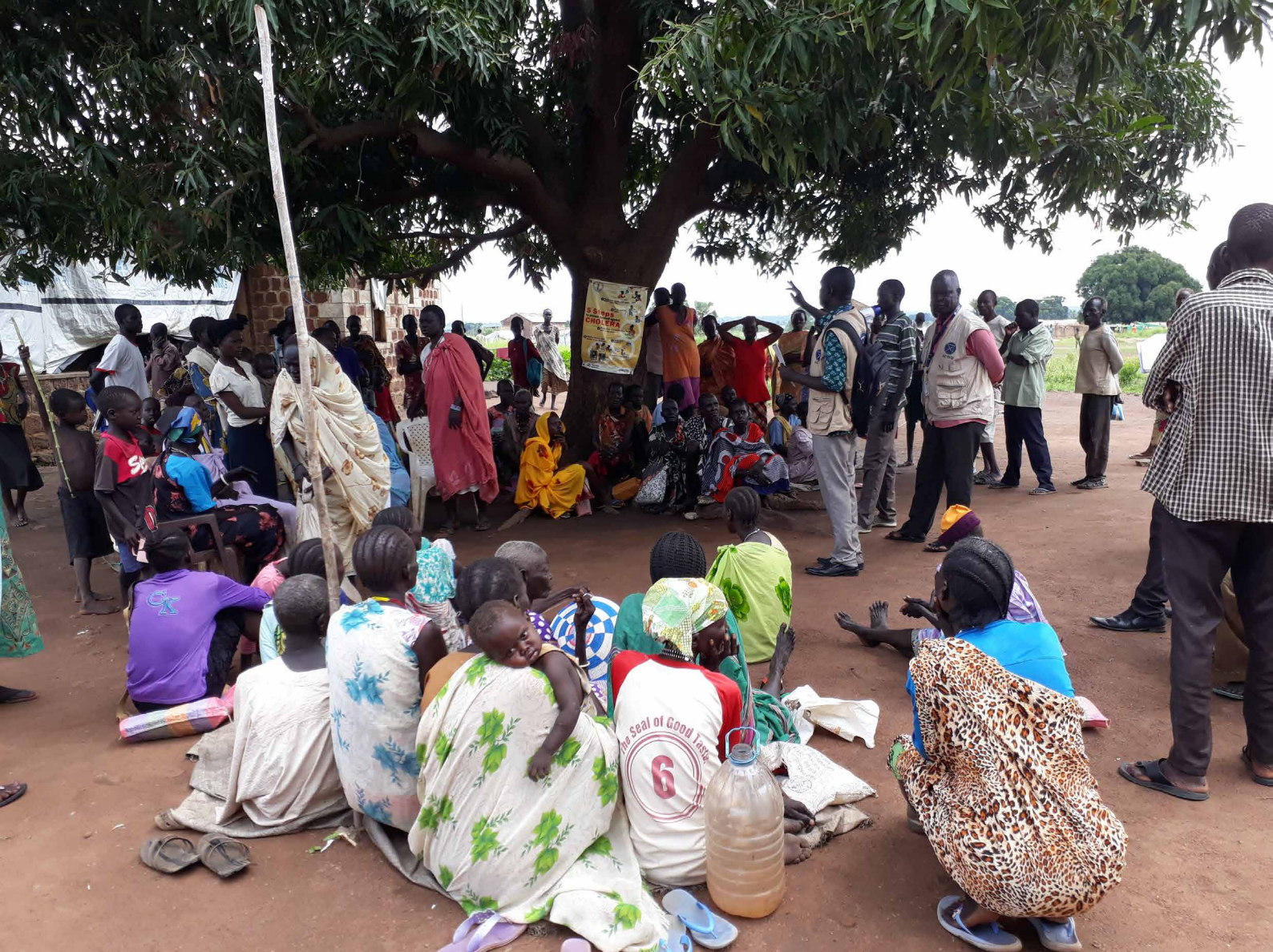
Community meeting in Wau Collective Site.