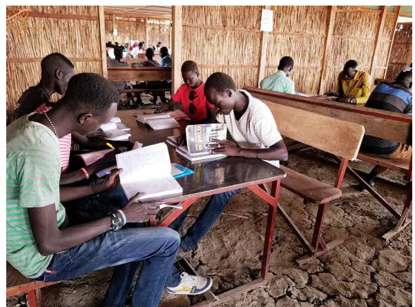
Functional youth library in Bentiu PoC, 2017

Functional youth library in Bentiu PoC site attracting an average of 200 female and male youths per day accessing Arabic and English reading materials in different fields