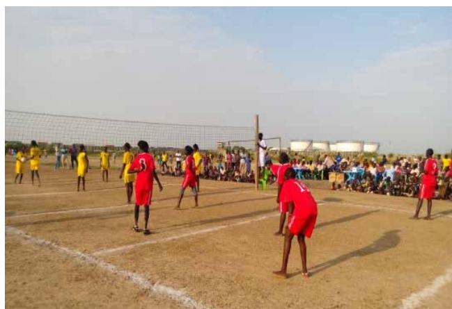
Female Youth Volleyball Tournament DRC CM, Malakal PoC, October 2017

In Malakal PoC site, CCCM have actively engaged with youth committees to innovatively ensure participation of female and male camp youth in sports activities as well as decision making processes.