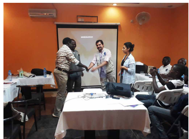
ACTED handover of collective sites in Wau to AFOD, December 2017

Handover of direct site management of collective sites in Wau from an international NGO- ACTED to a national NGO- AFOD on 20 December 2017