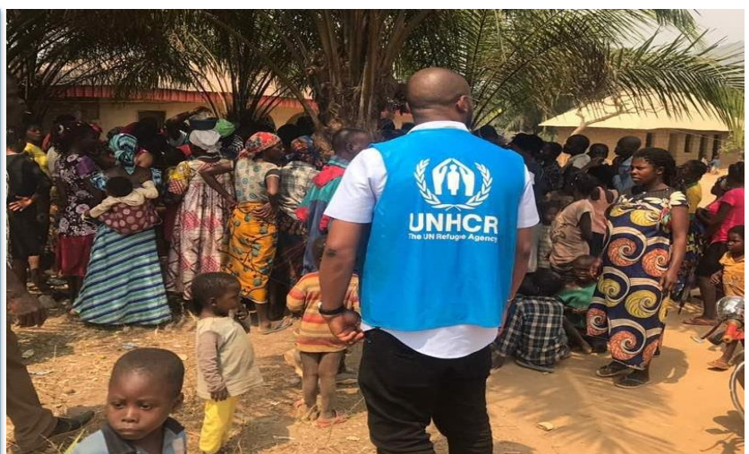
UNHCR staff engaging with Cameroonian refugees in Cross River state.