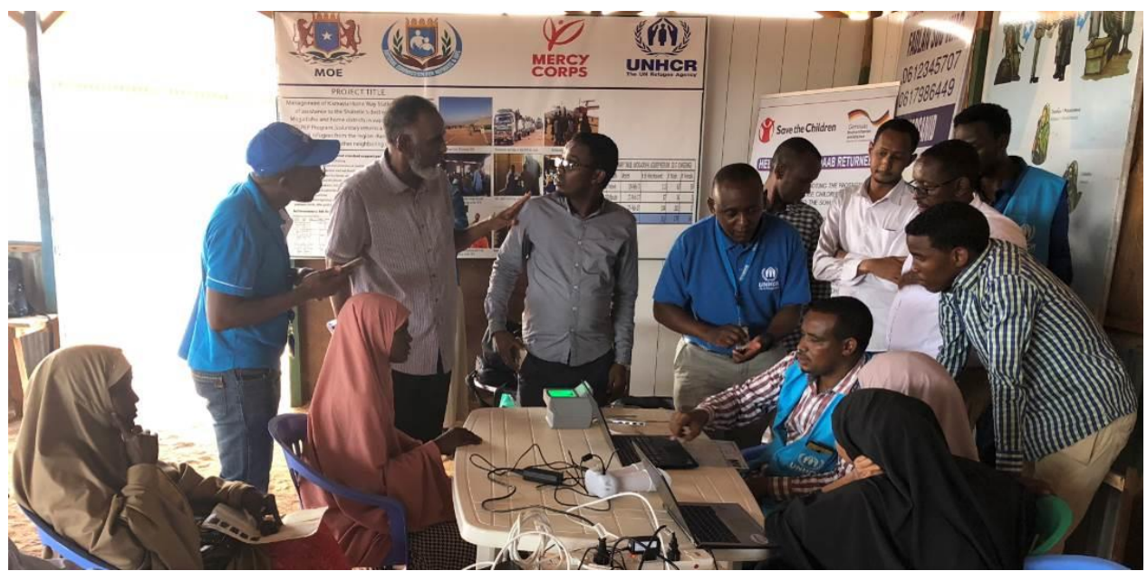
Staff members of UNHCR, partner Mercy Corps and Amal bank follow the setting up of the new payment process based on BIMS at the Home Way Station in Kismayo.

In February, UNHCR started to use the Biometric Identity Management System (BIMS), which identifies persons of concern through their fingerprints and irises prior to Cash-based Interventions (CBIs). The BIMS is a verification system that ensures that UNHCR and partners are able to identify returnee and ensures that assistance reaches to the right individuals. Through the introduction of BIMS, significant improvements were made to the payment process. One of the advantages is also that cash assistance is now made through individual bank accounts for returnees, which enhances the dignity and self-esteem of returnees and supports socio-economic recovery and stabilization of Somalia.