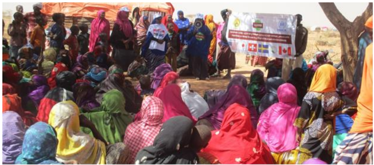
UNHCR partner conducting an awareness raising on SGBV response and prevention at IDP settlement in Burco, Togdheer region.

In February, 4,043 IDPs were reached with SGBV interventions, including community mobilisation for SGBV prevention and response, a talk-show on female genital mutilation (FGM) and its health and psychological effects, and the provision of medical, psychosocial, legal and material support to SGBV survivors.