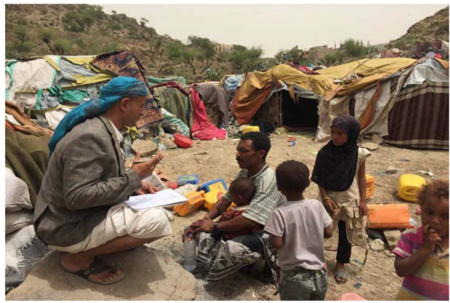
CSSW protection staff consult with displaced family in Taizz.