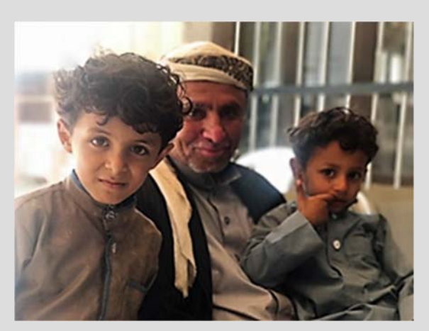
IDP family at ADRA community center.

Community centres such as these are an integral part of the Protection Cluster's community-based strategy to empower conflict-affected and displaced communities and ensure that they remain at the center of service provision and community activity, including for women, girls, boys and men.