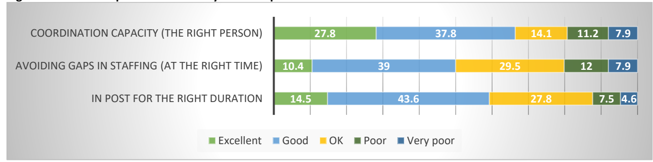
Figure 12: UNHCR's provision of timely and adequate cluster coordination staff

UNHCR is addressing the challenges with getting the right people in place at the right time through procedures for appointing and assigning cluster coordinators. Currently, most protection cluster coordinator posts are advertised according to functional groups that comprise standard job descriptions that encompass a large group of related protection jobs with similar duties and requirements. As there is no distinction between the protection cluster coordination role and other UNHCR protection-related roles, the process does not explicitly promote some of the most important competencies of the role such as interpersonal skills. While UNHCR has sought to ensure that it has sufficiently qualified staff members as cluster coordinators by creating posts at P4 and P5 level, cluster coordination positions are frequently in non-family duty stations and have poorer conditions of service, making them less attractive to experienced staff members at these levels.