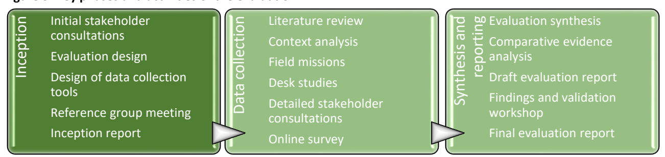
Figure 3: Key phases and activities of the evaluation

As illustrated in Figure 3, the evaluation comprised three key phases, each of which involved a specific set of activities outlined in the team's work plan. The team used a building-blocks approach to the evaluation, which involved dividing the evaluation process into sequential steps in order to build a robust chain of evidence.