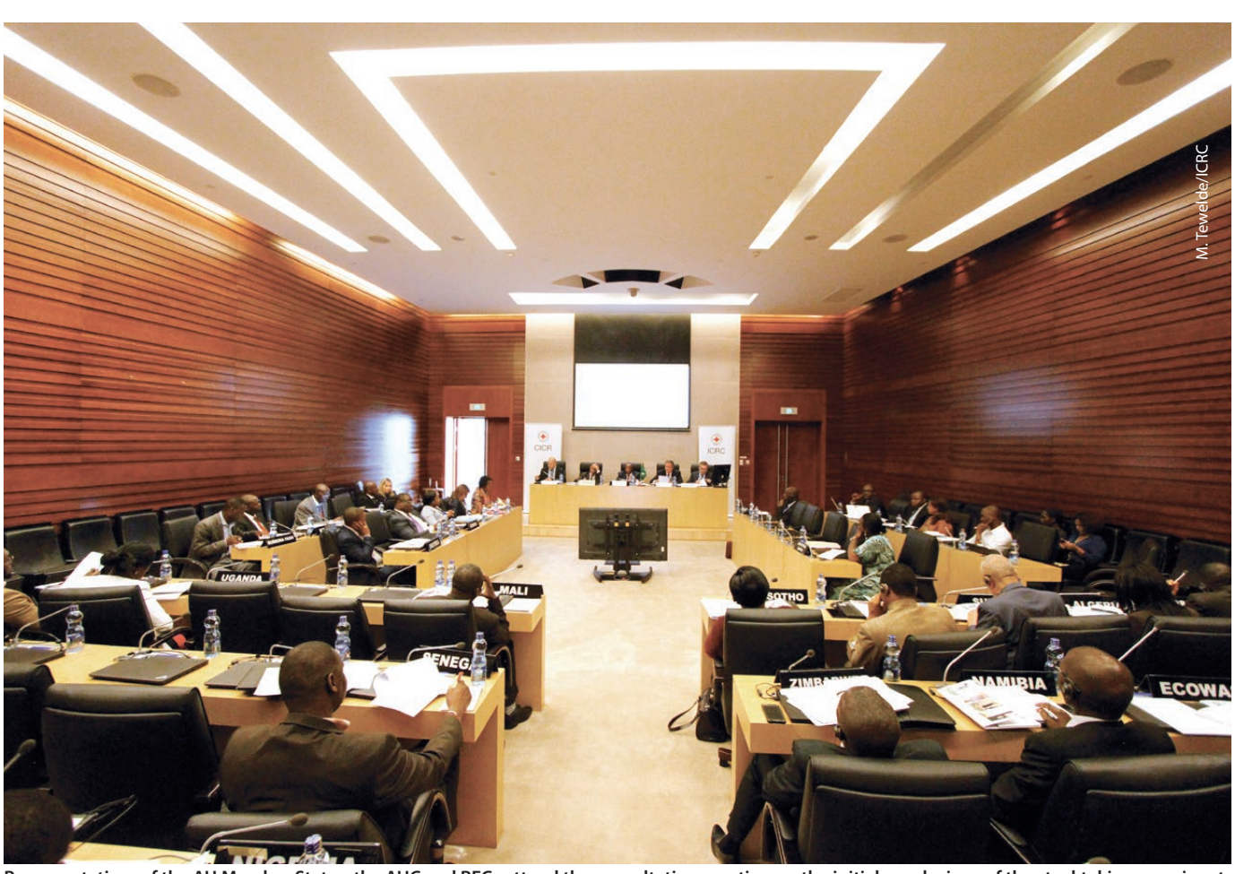
Representatives of the AU Member States, the AUC and RECs attend the consultation meeting on the initial conclusions of the stocktaking exercise at the AU headquarters in Addis Ababa, on 14 September 2016.