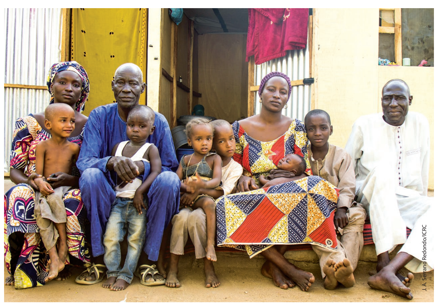
A family in Yola, Nigeria, who had to flee fighting (2015).