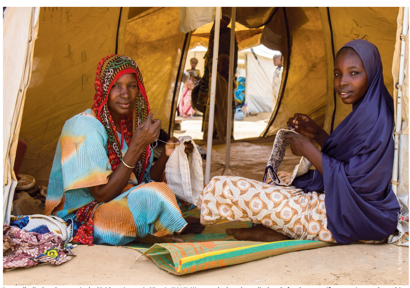
Internally displaced women in the Maiduguri camp in Nigeria (2015). Women who have been displaced often have specific protection needs resulting from their situation.