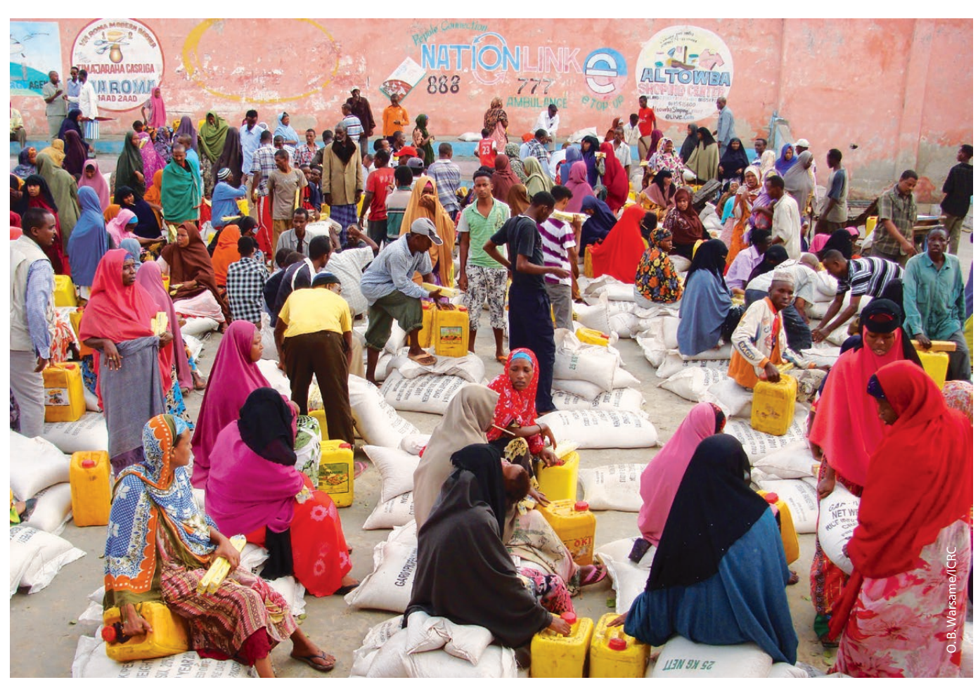
Displaced people in Mogadishu receive food from the ICRC and the Somali Red Crescent (2012).