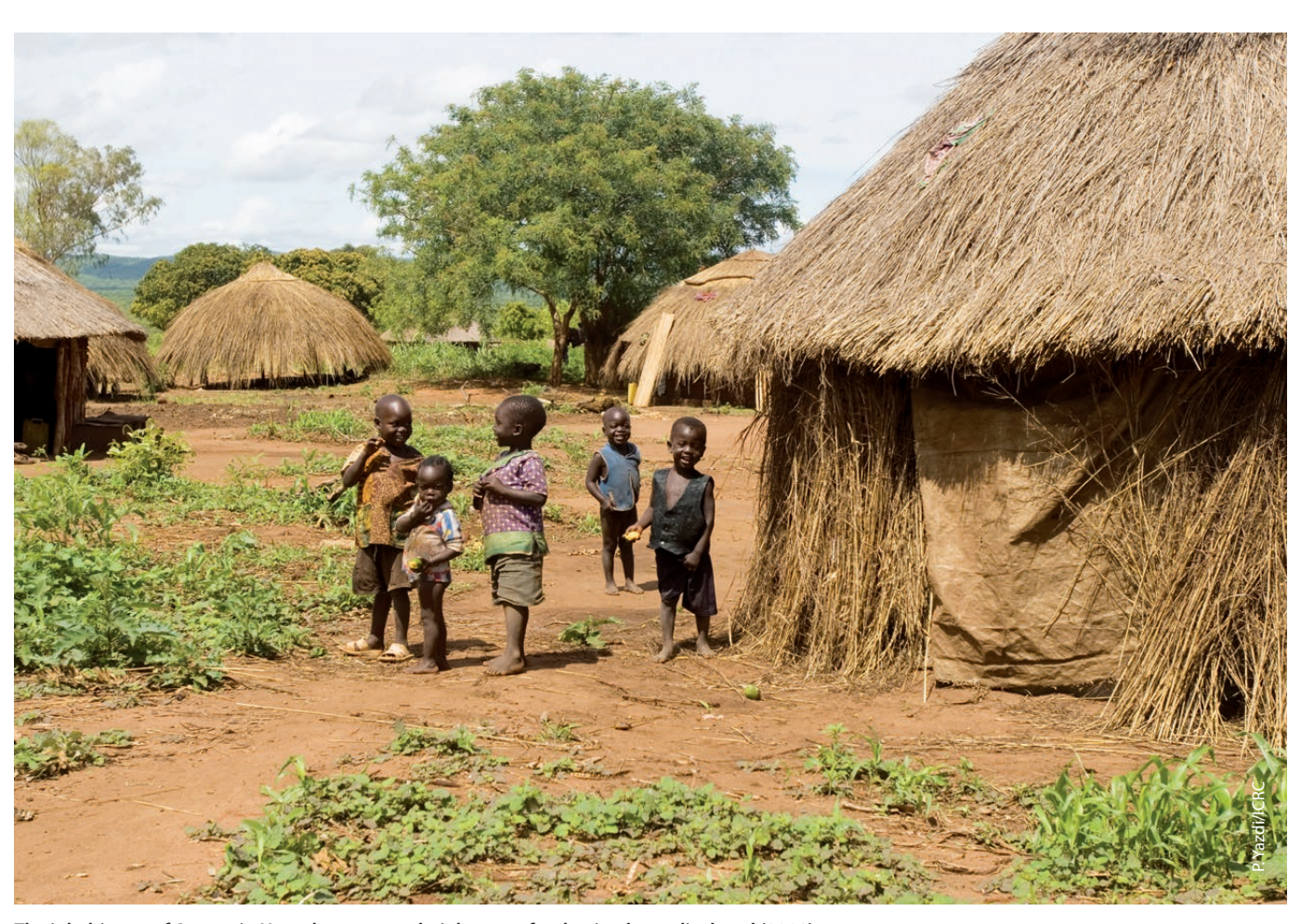
The inhabitants \ of \ Apyeta \ in \ Uganda \ return \ to \ their \ homes \ after \ having \ been \ displaced \ (2008).