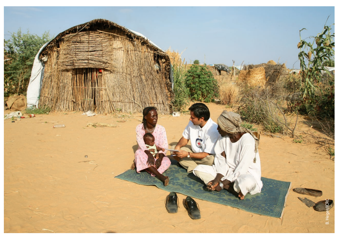
An ICRC delegate talks to displaced people in the camp in Gereida, Sudan (2007).