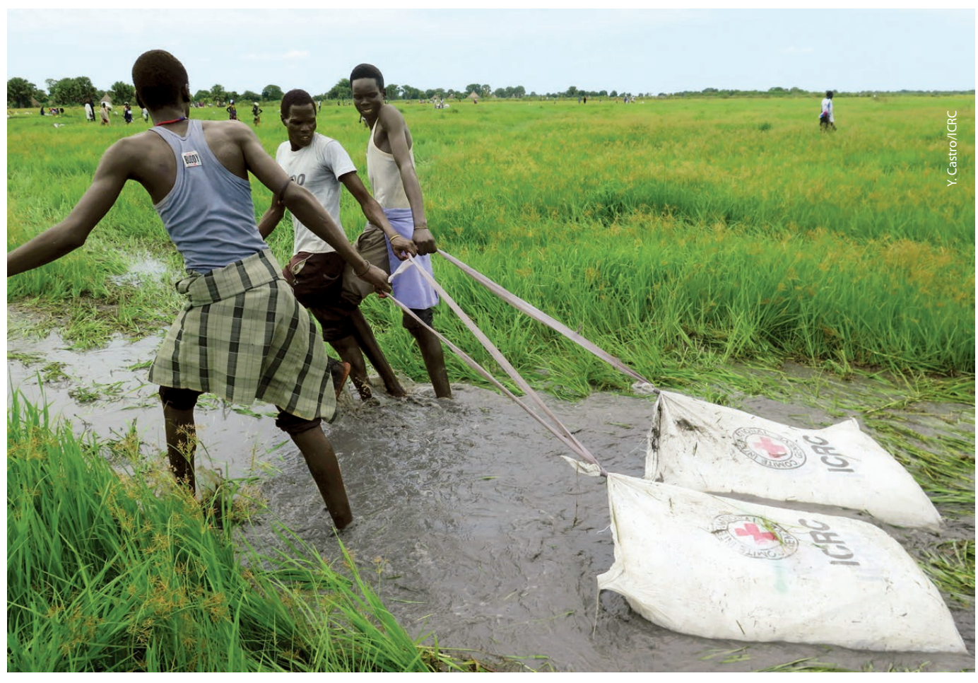
Men carry food rations airdropped by the ICRC in Jonglei State, South Sudan (2015).