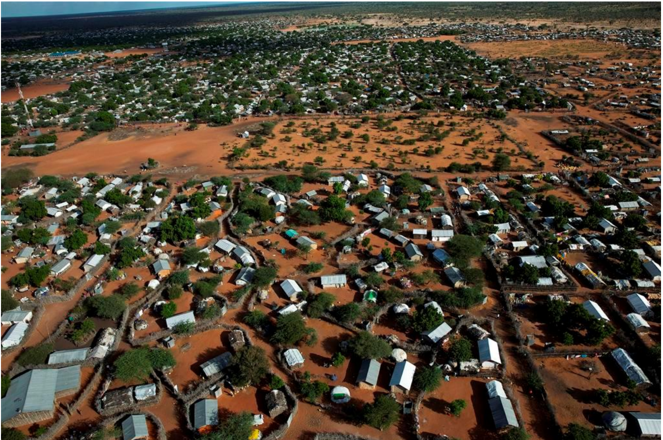
Hagadera from the air

In addition to these leaders, minorities (nationality or tribal groups), have also elected leaders. While the deteriorated security situation frustrates operations, it also presents an opportunity to more actively empower refugees to manage the day-to-day aspects of camp life. This includes the engagement of youth in providing peer-counseling, sanitation committees coordinating public health campaigns, promotion of community media and the involvement of refugee staff in delivering health and shelter services.