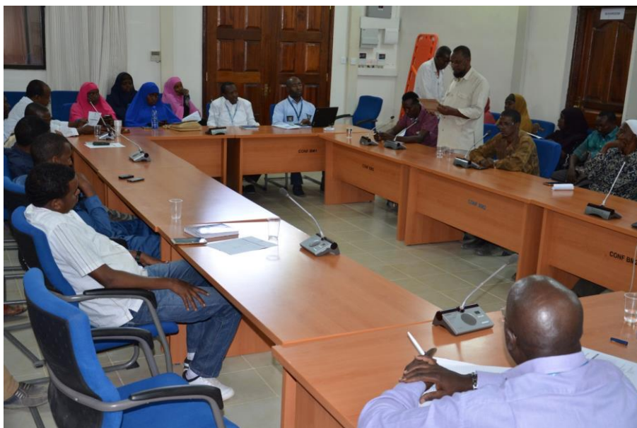
De-briefing session for the Go and See delegates at UNHCR Sub Office Dadaab.