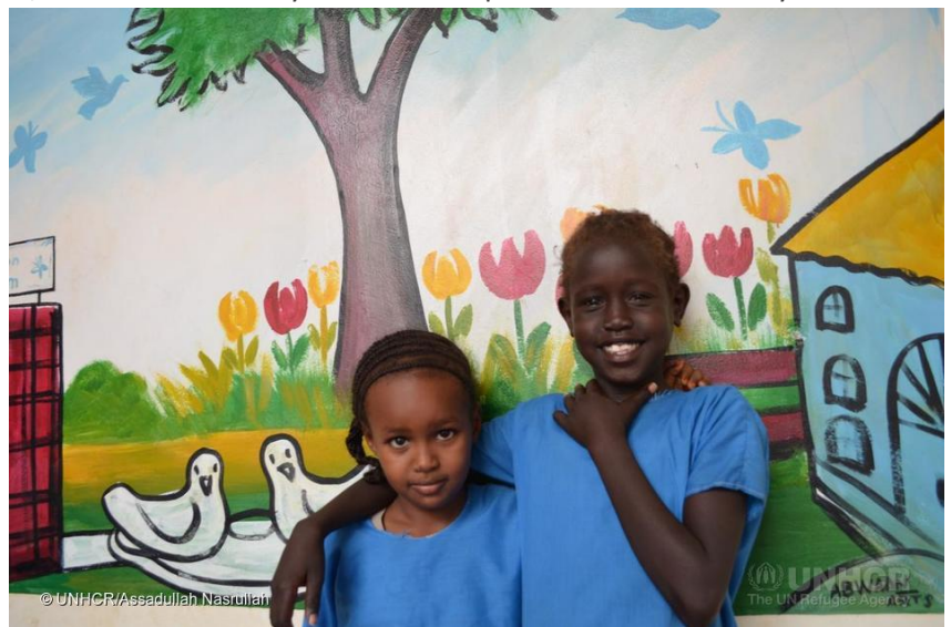
Refugee children in Ifo camp of Dadaab.