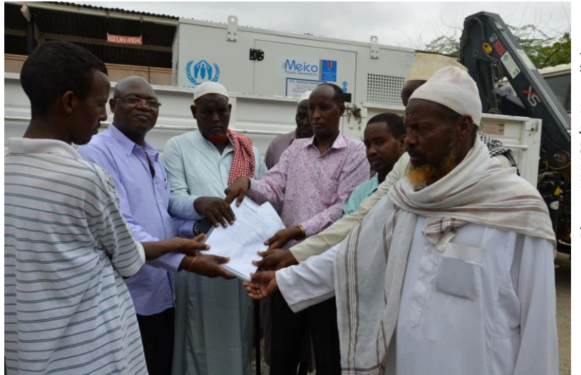
UNHCR's Dadaab Head of Operations hands over a power generator to the host community representatives.