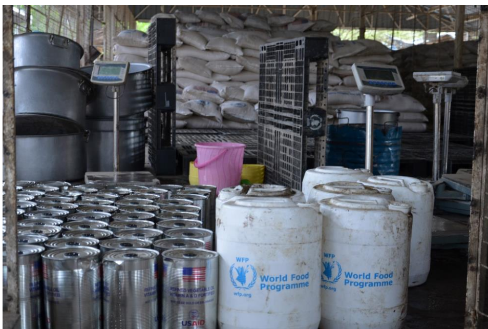
WFP food distribution center at Hagadera camp of Dadaab.