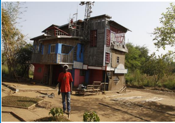
Multi-story shelter in Sherkole camp constructed by a Sudanese refugee