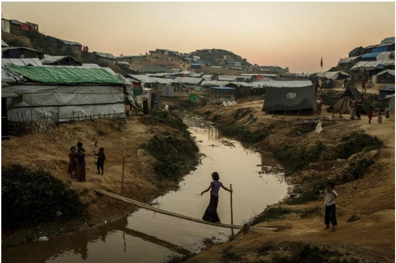
Rohingya adapt to new lives in Moynerghona refugee camp, Bangladesh.