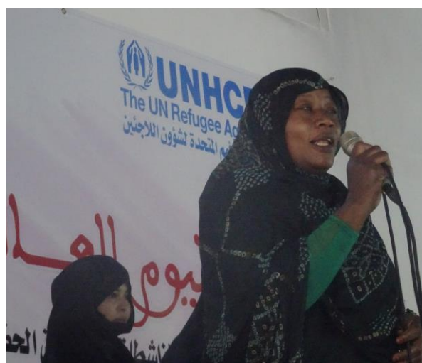
Musical performance during the celebration of International Women's Day, 8 March, Awserd camp.