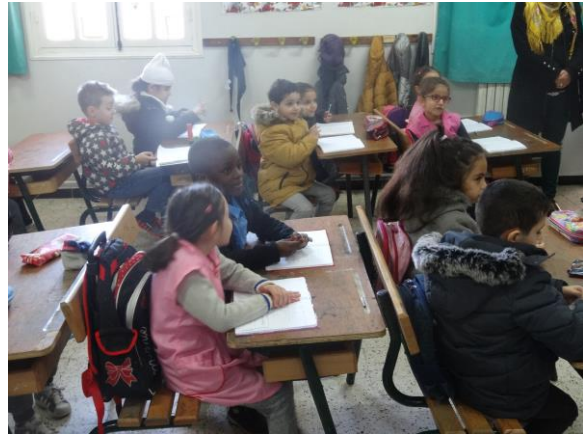
L) The Representative at Cheikh Bouamama School; R) children in the classroom, Cheikh Bouamama School. https://twitter.com/unhcralgeria/status/953641505369059328