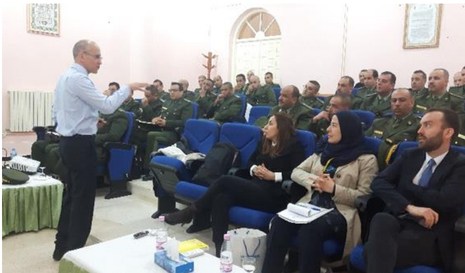
Training for the Gendarmerie.