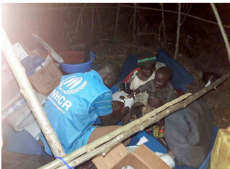
UNHCR public health staff treat children with acute watery diarrhea in Kyangwali settlement, Uganda's Hoima district.