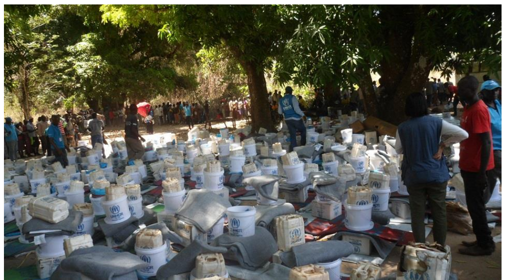
Distribution of non-food items to refugees and IDPs near Lasu, outside Yei town