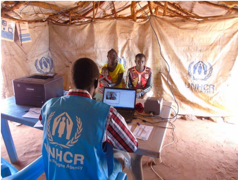
Verification of refugees in Yida refugee settlement