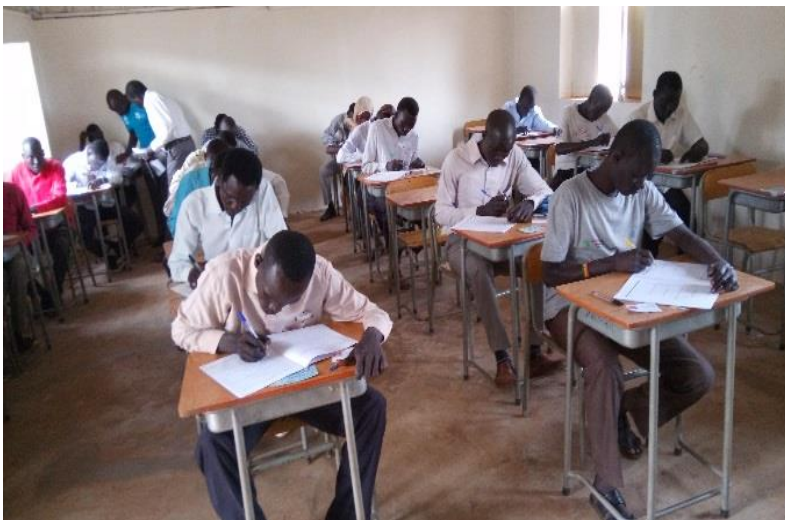
Secondary students undertaking South Sudan Certificate of Education Examination in Yusuf Batil Secondary school