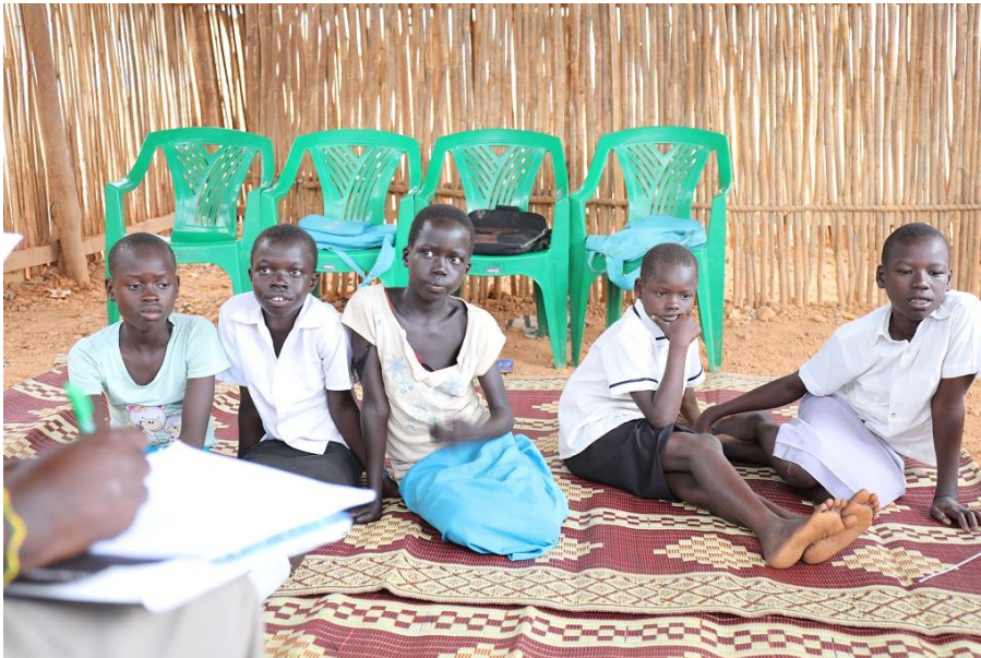
Participatory assessment with IDP girls at POC 3