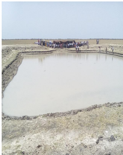
UNHCR and HDC constructed a 2,000 sq.m. water reservoir (hafir) in Jonglei State with funding from the European Union