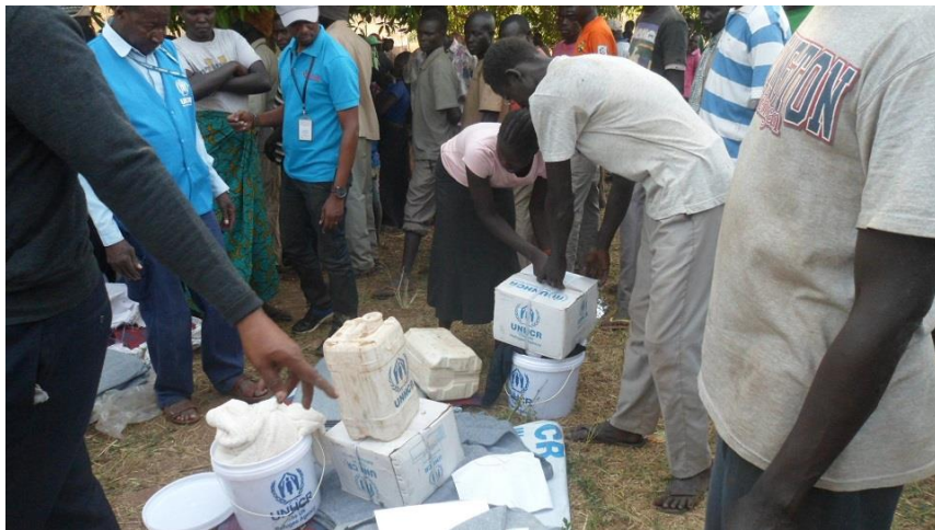
Distribution of non-food items to refugees in Lasu refugee settlement