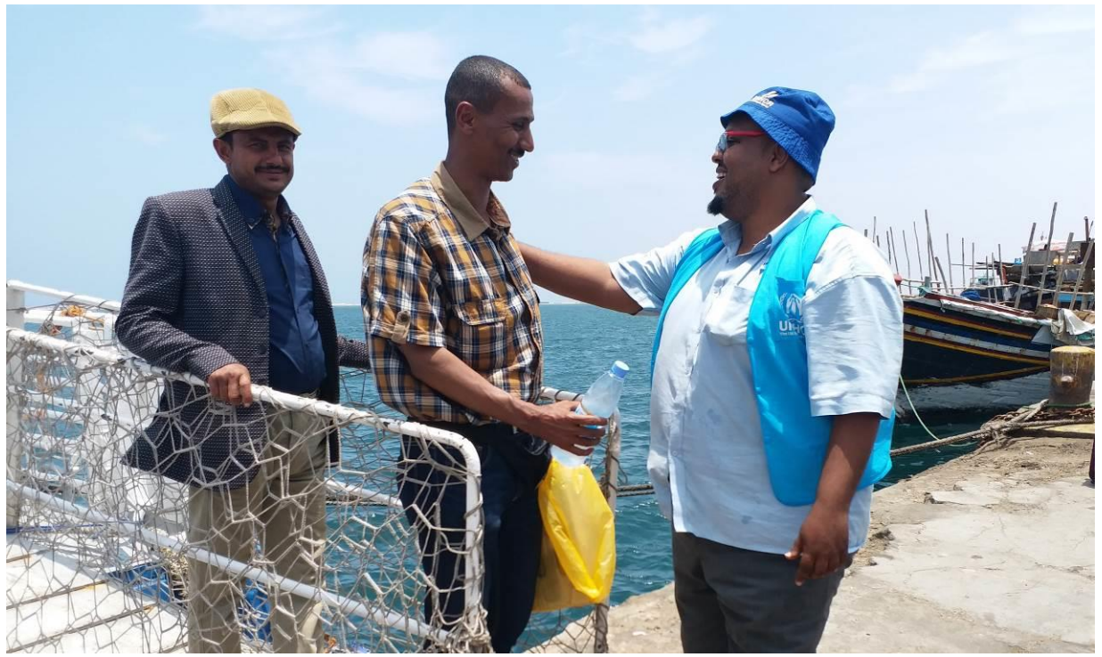
Yemeni refugees who fled the war in Yemen welcomed by UNHCR at the Berbera Port.