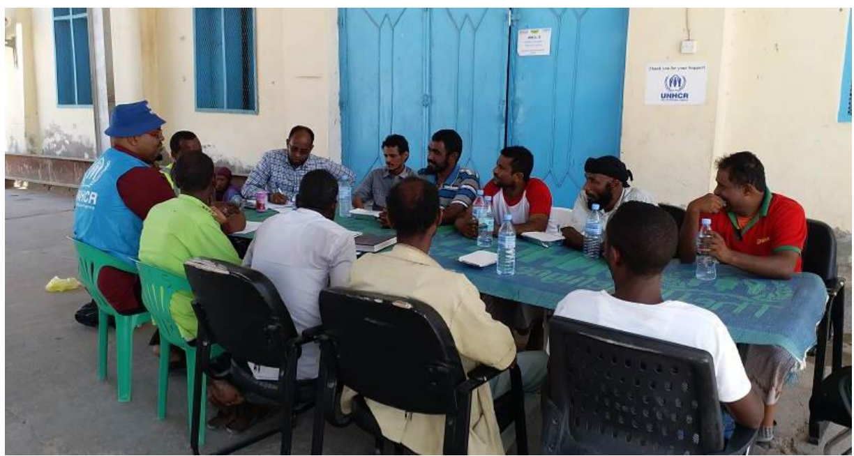
A two-day protection assessment of situations of refugees and asylum-seekers conducted by UNCHR and partners at the Berbera Reception Center.