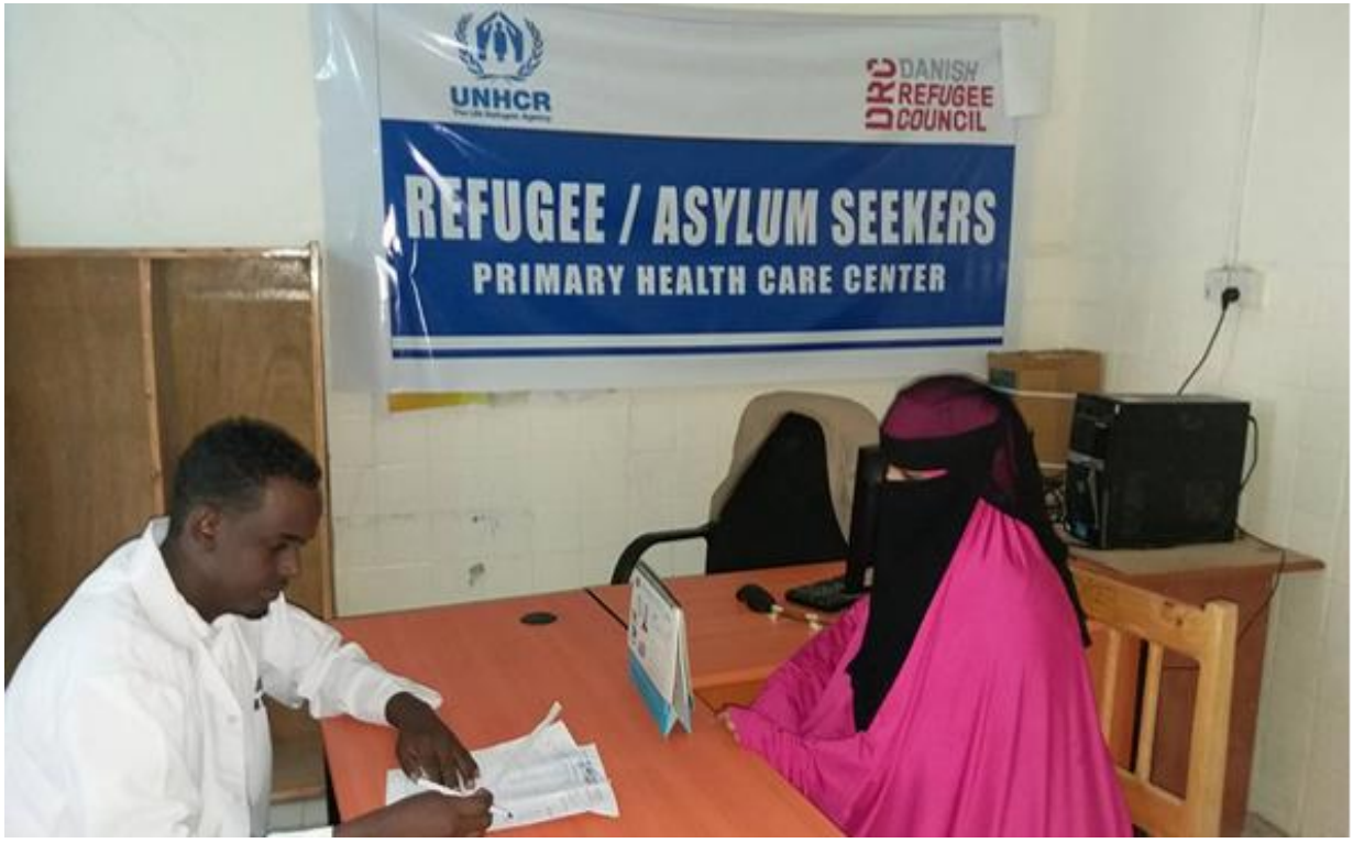
Yemeni refugees visiting Hargeysa Group Hospital to seek health care services in Hargeysa.