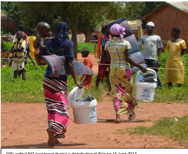
IDPs collect NFI assistance during a distribution in Bria on 15 June 2017

In the refugee context, the voluntary repatriation of 1,493 Sudanese Darfuri refugees from Pladama Ouaka Camp near Bambari was a noteworthy achievement. UNHCR is now working with the authorities to