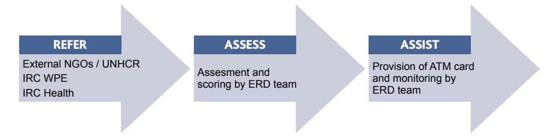
Figure 1: Referral system for cash transfers

The current scoring system for identifying regular cash assistance beneficiaries and winterization cash assistance beneficiaries was implemented in June 2015 and is based on a weighting of key indicators (linked to the VAF).<sup>13</sup> These include: