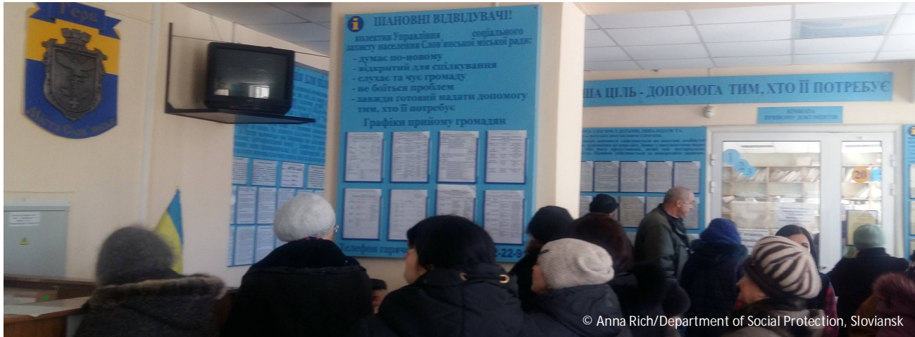
© Anna Rich/Department of Social Protection, Sloviansk