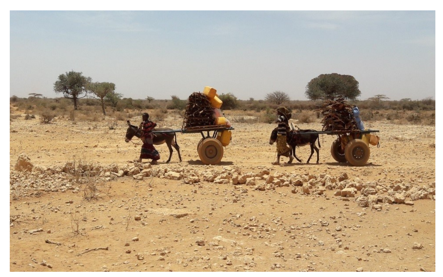
A drought affected family with their donkey cart carrying firewood and jerry cans in search of water in Xudur district, Bakool region.