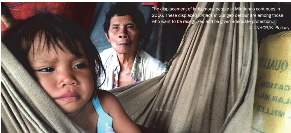
The displacement of indigenous people in Mindanao continues in 2016. These displaced Jumads in Surigao del Sur are among those who want to be recognized and be given adequate protection.

recent operation has intensified after the Joint Task Force of Sulu recovered the headless body of a Malaysian kidnap victim in December 2015. The displaced families remain with their relatives and friends in neighboring barangays.