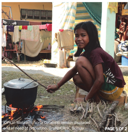
IDPs in Matalam, North Cotabato remain displaced and in need of protection.

More than 151 families (estimated 755 persons) left their homes in the sitios of Apod Apog, Kasimbit and Pantaron in Barangay Manobo of Magpet municipality, North Cotabato province as a result of an armed confrontation between the New Peoples' Army (NPA) and forces from the para-military group known as Bagani on 10 January. Local authorities reported that the firefight started when members of the Bagani group allegedly attacked a nearby command post of the NPA. According to the barangay officials, this is the second time that the presence of the Bagani was observed in the area. All the IDPs have already returned home but with limited access to their farmlands due to continued fear of possible armed attacks.