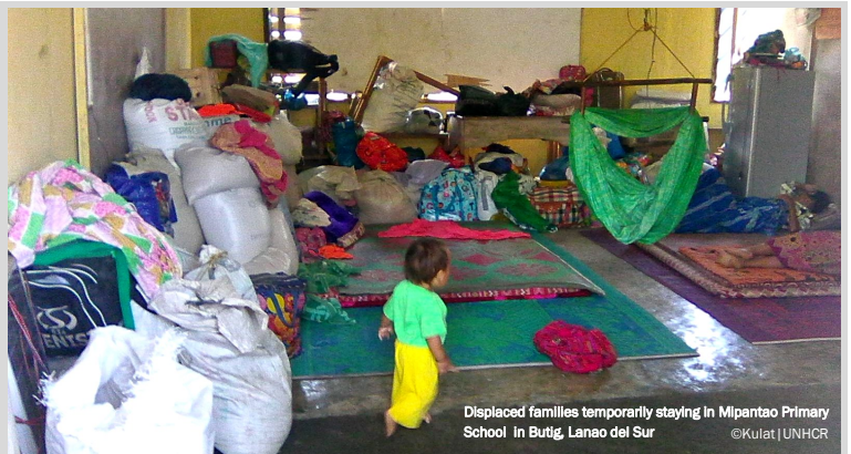
Displaced families temporarily staying in Mipantao Primary School in Butig, Lanao del Sur

After 11 months of displacement, approximately 3,493 families have returned after military operations against the Maute Group temporarily ceased in the municipality of Butig, Lanao del Sur province. However, more than 637 families from the barangays of Poctan, Ragayan and Coloyan remain displaced with their relatives due to fear for their safety. IDPs are hesitant to return because of the lack of clear information or concrete security assessments from the authorities. According to reports from protection partners, some 61 houses were totally destroyed and 34 houses were partially damaged, preventing IDPs from returning to the barangays of Bayabao, Poctan, and Ragayan.