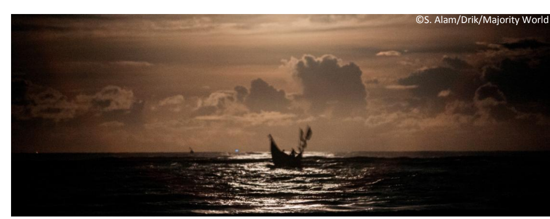
A small boat ferries passengers off the coast of Teknaf, Bangladesh, to a larger vessel in the Bay of Bengal.