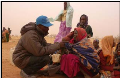
UNHCR aid worker assisting Sudanese refugees in Chad.

is currently in the process of concluding five voluntary repatriation operations; namely to Angola, Eritrea, Rwanda, Sierra Leone, and north-west Somalia. But we are also seeking additional resources from the international community to start preparations for organised voluntary repatriation to Burundi, the Democratic Republic of Congo, Liberia and Southern Sudan.