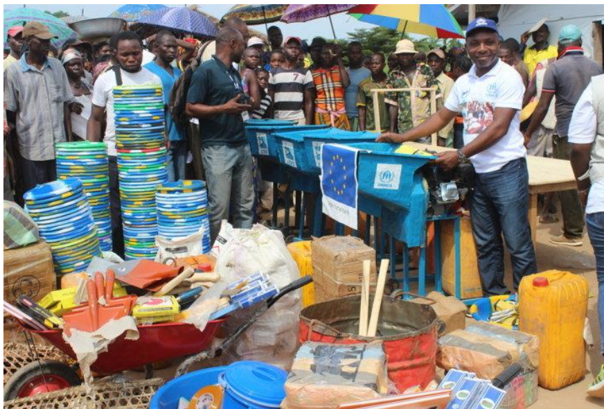
Distribution of farming tools in Inke camp

Conditions of new arrivals are extremely precarious: there is lack of shelter and core relief items, drinking water, food, sanitation and healthcare. They arrived with few belongings, and often their houses and property have been burned down or looted. Some of them are working in the fields of host community for little money or some food.