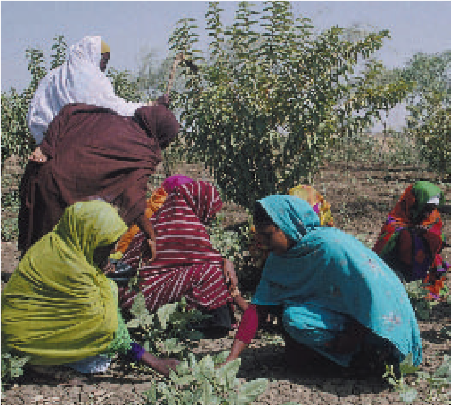
Sudan: Refugees are encouraged to make the best use of, and preserve their environment. Eritrean refugee women growing vegetables on a communal plot in Showak camp.