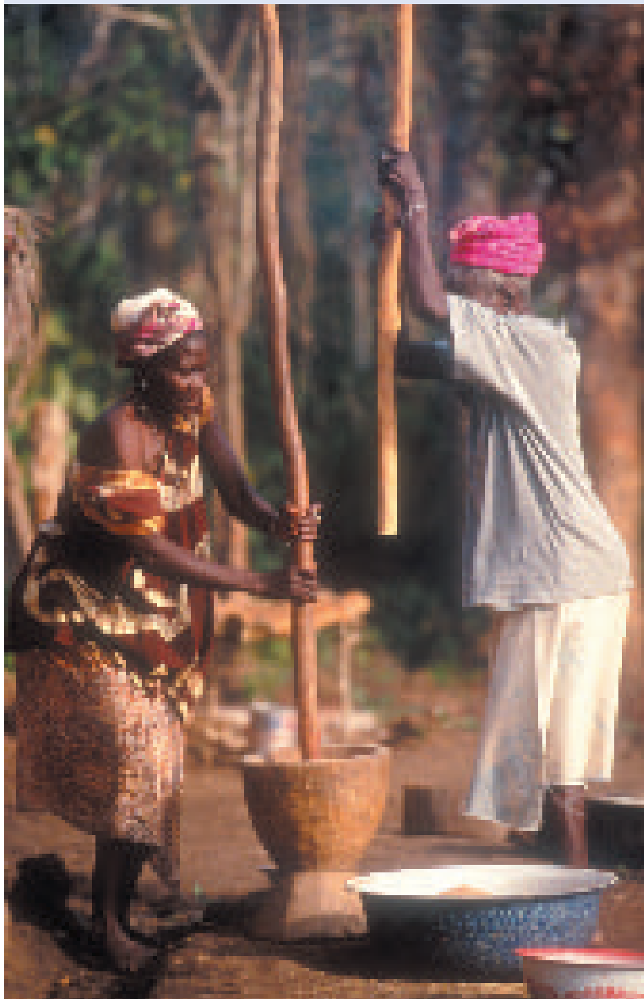
Sierra Leone: Liberian refugee women at Largo Camp, in Kenema region, working hard to sustain themselves through remunerative activities under a micro-credit programme.

Empowering refugee communities towards self-reliance is a key strategy for ensuring their protection. Consequently, UNHCR developed a joint pilot