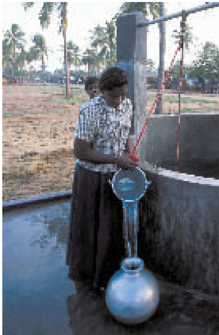
Sri Lanka: The inclusion of IDP returnees in permanent relocation villages, like this one in Tharanikulum, Vavuniya, is part of the national development plan for reintegration of IDPs in post conflict conditions.

Under the DAR/DLI approaches, UNHCR supported the Zambia Initiative in the areas of programme design and resource mobilization. In December 2003, the first annual review meeting was organized by the Government of Zambia and UNHCR with the participation of United Nations agencies, donors and NGOs. Donor support for the Zambia Initiative has been very encouraging. In 2003, UNHCR also assisted the Government of Uganda in developing a DAR initiative based on the existing Uganda Self-Reliance Strategy.