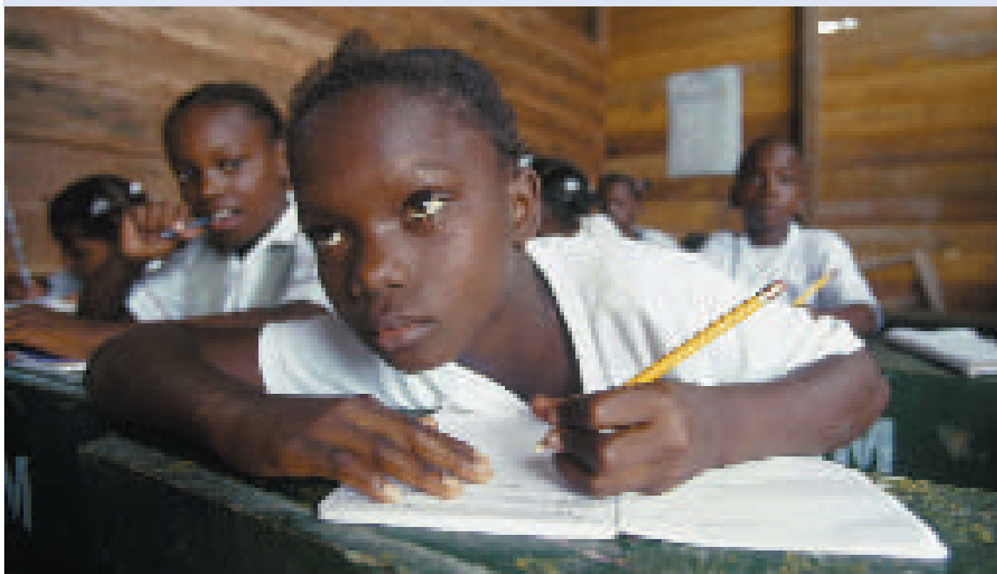
Colombia: IDP children receiving lessons in the school of the refugee centre 'Villa Espana' in Qui'odo.

Access to education was supported in 2003, through funds for global scholarships. The Houphouët-Boigny Peace Prize programme sponsored 105 students in Ghana and Uganda, of whom 83 per cent were females. Since the creation of the programme in 1996, an average of 100 refugee students each year have received scholarships for