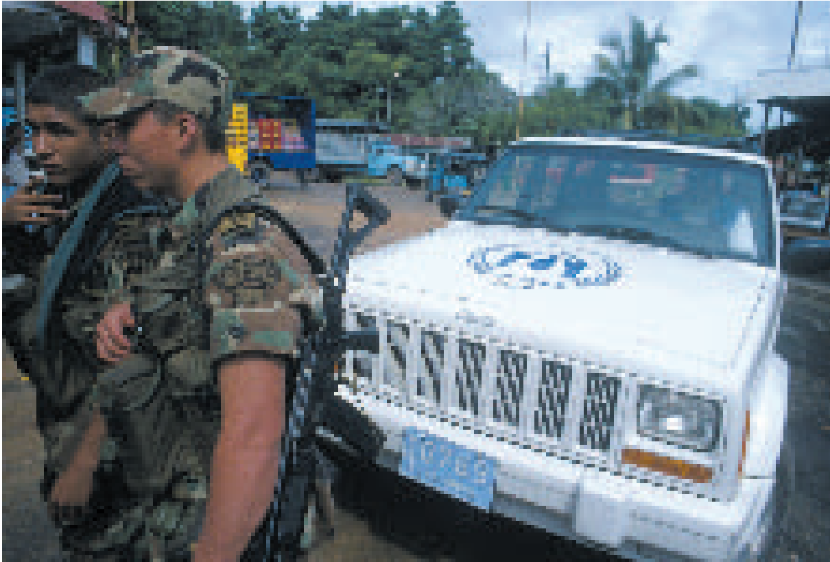
Colombia: Increasingly, aid agencies have to work alongside, or with the military who may be directly involved in conflicts, as in Colombia and elsewhere. Here, soldiers are accompanying UNHCR staff in Barrancabermeja.

In February 2003, UNHCR began the distribution of an interactive security awareness CD-Rom "Basic Security in the Field" (English and French versions), jointly produced by UNSECOORD and UNHCR. In August 2003 an inter-agency working group, together with UNSECOORD, started developing a second CD-Rom, "Advanced Learning on Security in the Field," which should be ready by the end of 2004.