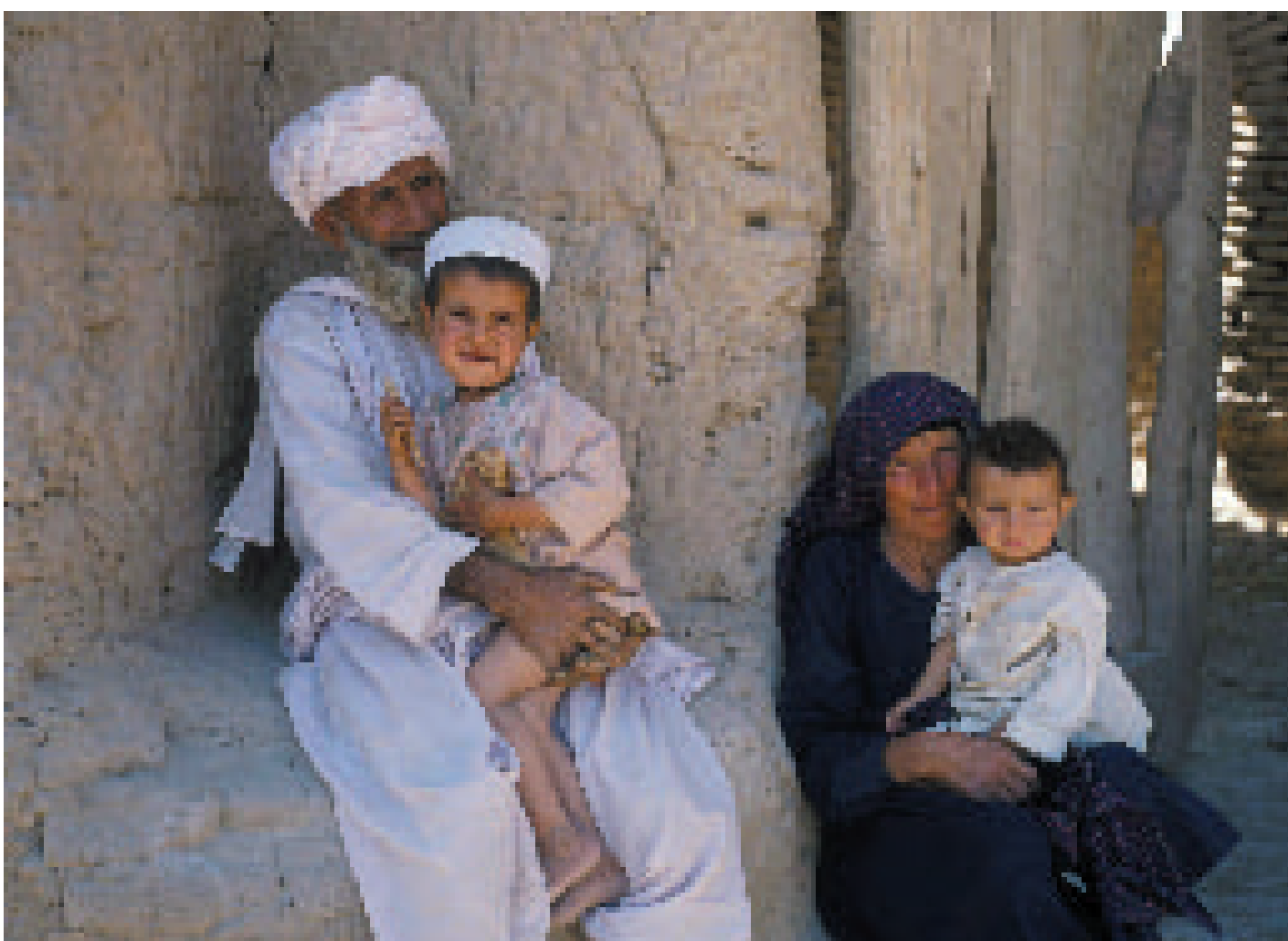
Afghanistan: Many older refugees/returnees look after their grandchildren to enable parents to earn a living. IDPs in Jangaan village where UNHCR established a micro-credit resettlement programme.

suitable technical presence in the field to address the social and community aspects of protection, particularly in relation to protection of refugee children and the promotion of gender equality. This was achieved through the work of a combination of regular UNHCR staff, JPOs, UN Volunteers and deployments and secondments from Save the Children (Sweden, Norway) and other partners. While major gaps remain, there is a growing awareness among UNHCR managers and donors, of the essential role of the CS function.