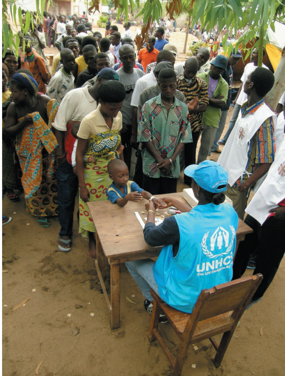
Benin: UNHCR registers Togolese refugees and hands out wristbands near the border town of Hilakondji.

UNHCR continued its efforts to find durable solutions for the Mauritanian refugees living in Senegal and Mali since 1989. The Office proposed a political approach through diplomatic exchanges involving the three