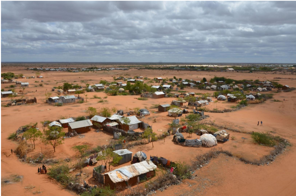
Ifo 2 camp of Dadaab with current population of 22,829 individuals of whom 7,893 individuals have registered for Voluntary repatriation.