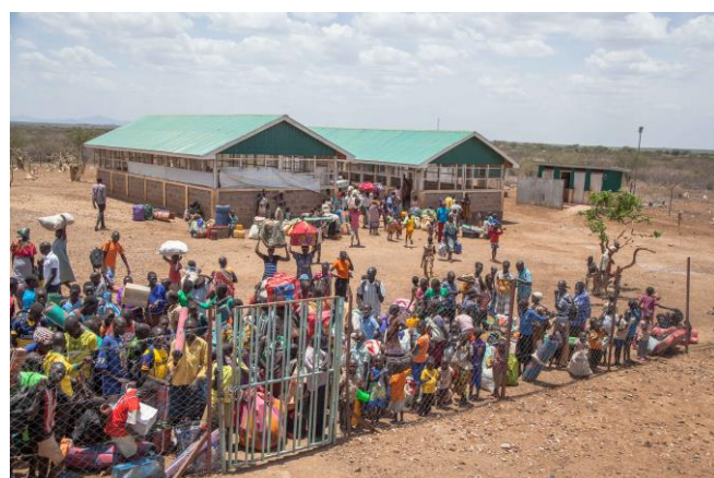
Picture showing new arrivals from South Sudan at Nadapal Transit Centre at the Kenya – South Sudan border. Over 15,341 refugees from South Sudan with heightened protection risk have been received and registered since the beginning of January 2017.