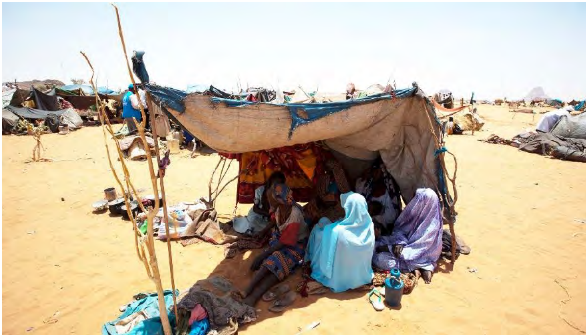
Area for new displaced people in Kalma camp for Internally Displaced Persons, South Darfur. March 9, 2014.

The influx of hundreds of thousands of migrants into Europe in 2014 and 2015 18 has posed major challenges to EU governments. For years, migrants travelled from central and northern Sudan to Libyan and Egyptian ports, hoping to cross over into southern Europe. As of mid-December 2016, more than 173,500 and as many as 181,126 migrants (an increase of 27,000 to 29,000 from 2015) had traveled the "central Mediterranean route" to Italy. 19 A similar number of migrants—182,534 by one count—had moved through the "eastern Mediterranean route" toward Turkey and Greece in 2016, a