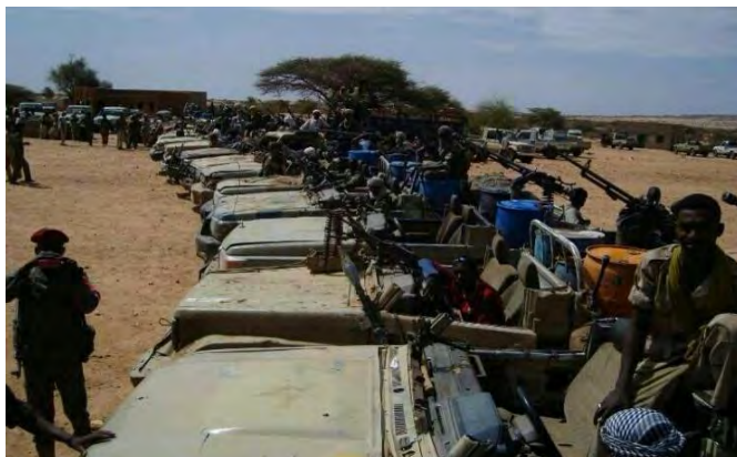
Vehicles that the RSF claim to have seized from the rebel forces in East Jebel Marra, January 2015.

People in the affected areas have coined satirical labels to describe the appropriation of government-issued vehicles by the militia members. The term "Sargha Halal," Arabic for "legalized theft," is commonly used. Locals also called the vehicles that are illegally acquired from neighboring countries "Boko Haram vehicles." What makes such vehicles recognizable is their movement within the five Darfur states without license plates. Vehicles are among the most prized looted goods and have a high market value even when militiamen are not in a position to prove ownership or provide documentation for how they obtained the vehicles. According to one report, the sale value of a 2016