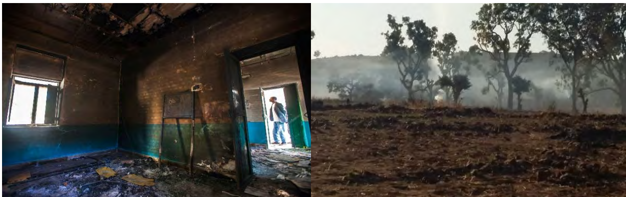
Left: A burnt room of the looted clinic in Labado village, East Darfur, which is currently inoperative, November 19, 2013. Right: Bombardment in west Jebel Marra, photo received February 2016.

The state's use of militias from a particular defined group to attack others outside that group has had a devastating effect on populations seen as loyal or sympathetic to the armed opposition. The burning of villages, killing of civilians, looting, rape and abduction of women and girls, and forced displacement of thousands are the hallmarks of RSF incursions into armed opposition-held areas in Darfur, South Kordofan, and Blue Nile states. The systematic stripping of the assets of the targeted populations, particularly livestock, appears to be intended to undermine livelihoods and dignity and condemn the people of these areas to lasting destitution. The targeting of entire communities for punishment is also meant to dent the morale of opposition fighters as they see "their" otherwise resilient families and communities experience the harmful effects of their opposition to the government.