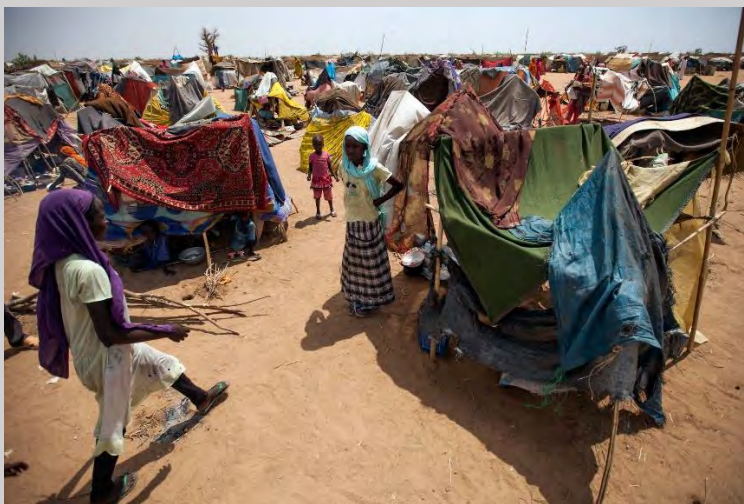
Internally displaced people in Kalma camp, South Darfur, March 9, 2014.

Sudanese leaders obfuscate the fact that the regime’s own oppressive policies and attacks on the population have forcibly displaced millions of Sudanese people. As the European Commission has referenced in its own publications, some 5.8 million people in Sudan (15 percent of the population) need humanitarian assistance from the international community. 60 Some 3.3 million of them are in Darfur alone. 61 There are as many as 3.2 million people who are internally displaced in Sudan, 2.6 million of them in Darfur and an estimated 600,000 of them in South Kordofan and Blue Nile states. 62 Sudanese government-backed forces have heavily attacked civilians in these three areas in particular for years, creating this large-scale need and displacement within Sudan and also sending Sudanese populations over international borders in search of security and economic opportunity that is not available to them because of the Sudanese government’s policies.