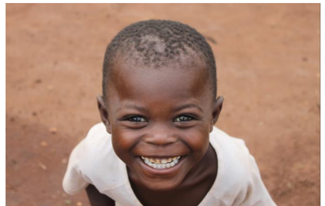
A child living in Cacanda reception centre.