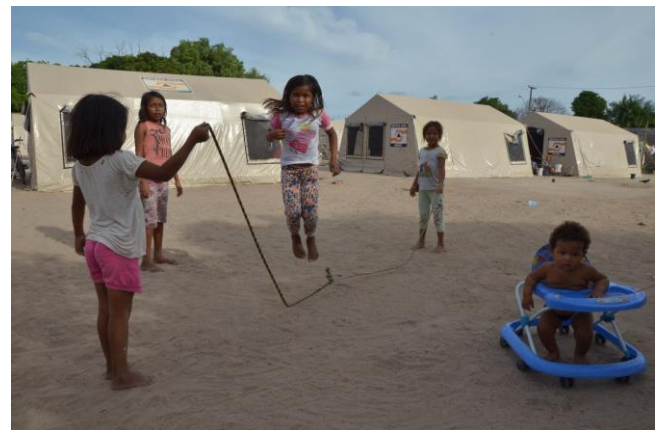
Children play at the shelter in Boa Vista, Brazil, where new tents have been set up with the support of UNHCR.