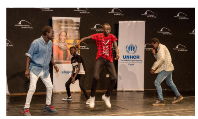
South Sudanese rap dancing group 'Alex Crew'

UNHCR's field office in Alexandria worked closely with refugee and asylum-seeker communities in identifying artists in Alexandria. The event showcased talents from Syria, Sudan and South Sudan who performed oriental and rap singing, folkloric African and Syrian dancing, and played instruments.