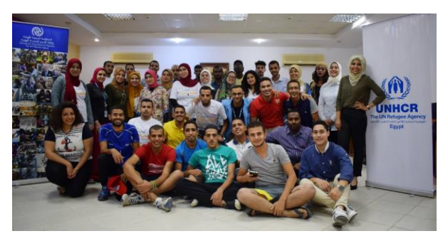
Social Cohesion participants at the end of the workshop with UNHCR, IOM and MOYS facilitators and staff

young people who are active in Egypt's civil society addressed challenges related to engaging refugees and migrants in Egyptian society through a "Human Centered-Design" (HCD) approach. At the end of the workshop, the participating youth drafted recommendations to UNHCR, IOM, and the Government of Egypt, which were presented at the closing of the event.