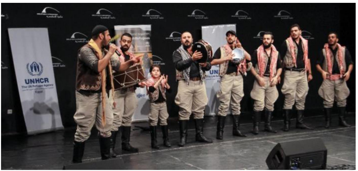
Syrian 'Seif el Sultan' dancing group performing the traditional 'Arada' dance

Refugees and asylum-seekers have been an increasing part of Alexandria's cultural life since the signing of a Memorandum of Understanding between UNHCR and the Bibliotheca Alexandrina in 2014.