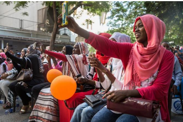
Artists and audience during the event 'Our Diversity Inspires Us'