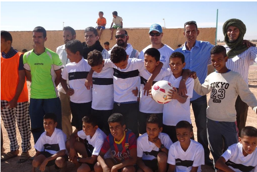
One of the youth football teams participating in International Children's Day festivities.