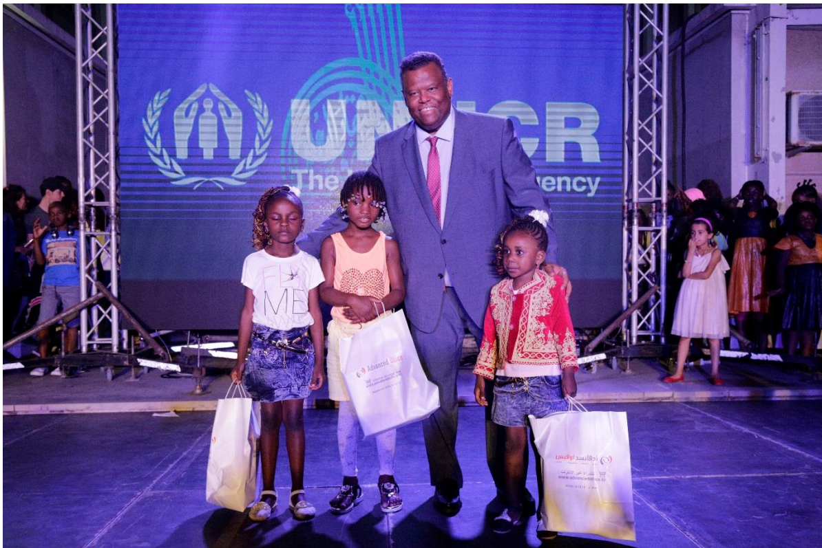
UNHCR Representative with young refugee fashion show participants.