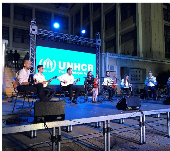
A musical performance during the celebration of World Refugee Day in Algiers, 20 June.