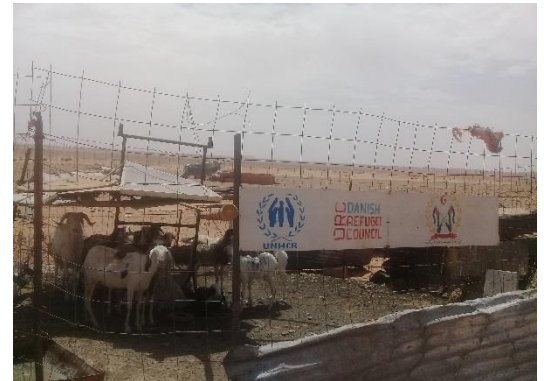
Livestock project supported by UNHCR and DRC, Laayoune camp.