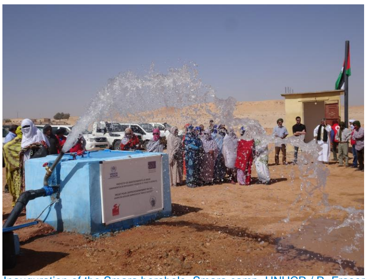
Inauguration of the Smara borehole, Smara camp.