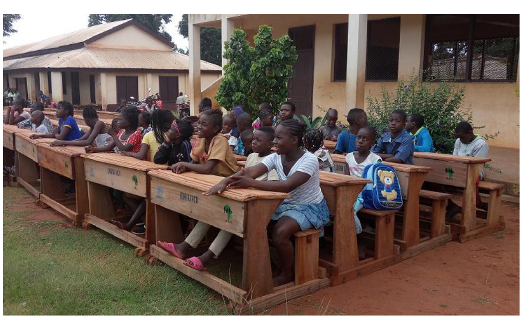
Some of the 600 school benches provided by UNHCR to six public schools in support of education in CAR