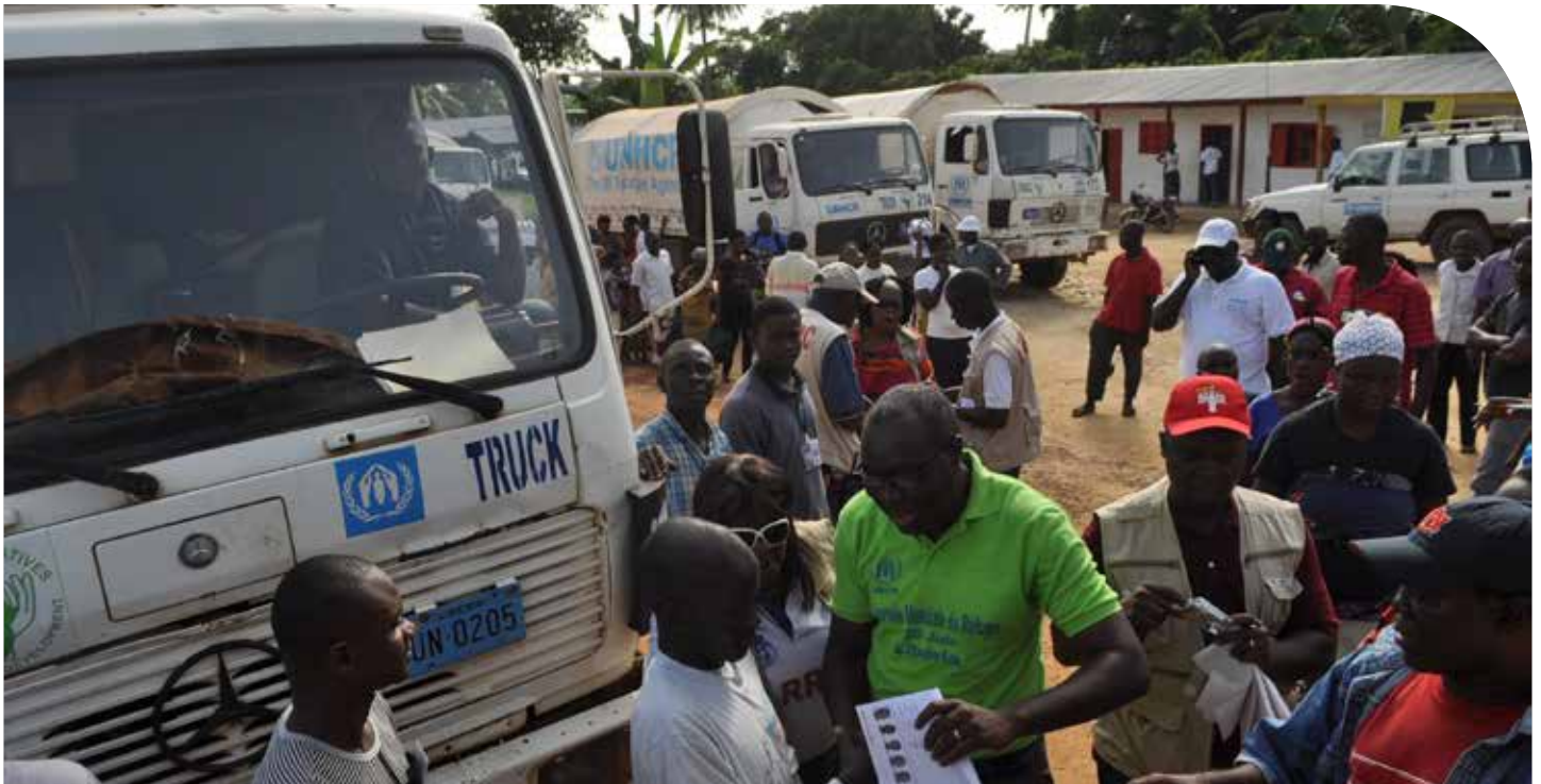
Ivorian refugees assemble for voluntary repatriation in June