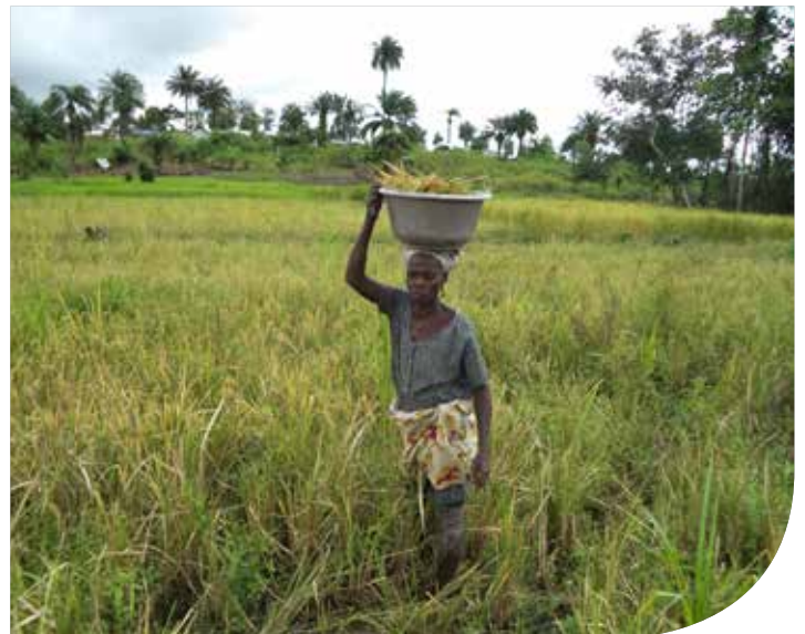
Agriculture is thriving at Bahn Refugee Camp.