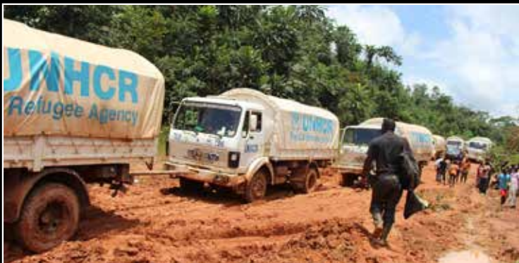
Supply trucks get bogged down in the rainy season.