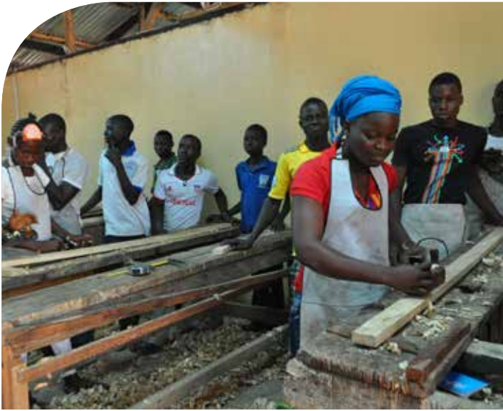
Refugees at PTP Camp learn carpentry skills

Refugees are learning an assortment of trade and vocational skills they can use to support themselves in the coming years, thanks to active livelihood training programs in all three of Liberia's refugee camps.