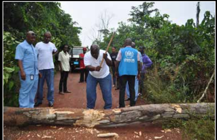
Staff clear the road so a repatriation convoy can get through.