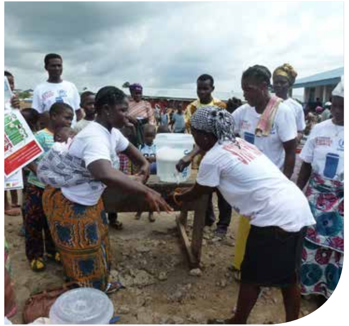
A group uses drama to raise awareness about Ebola at Little Wlebo Camp.