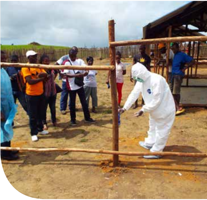
MTI trains health care staff on Ebola protocols, while the CCC is under construction.