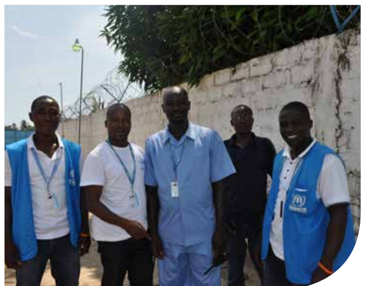
Staff members at the UNHCR compound in Harper.