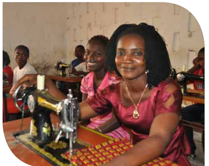
Refugees receive training in tailoring and other vocational skills.

UNHCR staff stand ready to respond quickly to changes in the political and public health environment that will allow for the restart of voluntary repatriation and further camp consolidation.