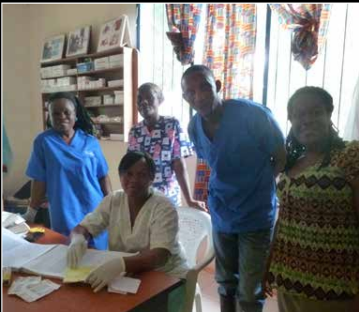
The PTP Health Clinic provides basic health services to refugees.