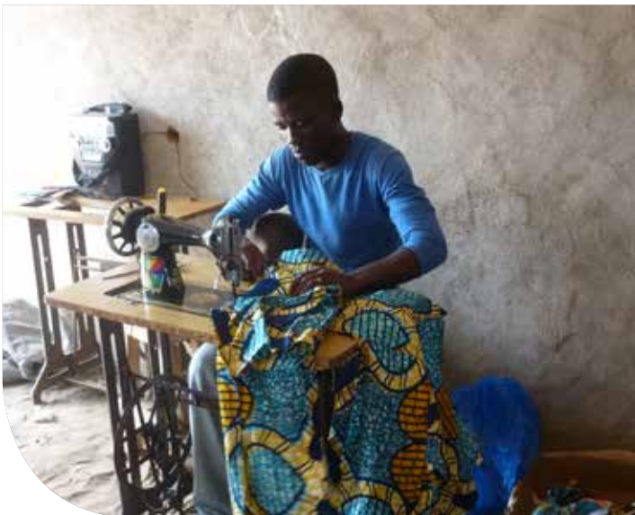
A student learns tailoring skills at Little Wlebo Camp.