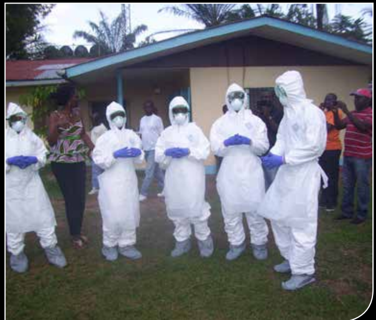
After the advent of Ebola, MTI provided training for health-care workers on the use of PPEs at new isolation centers and CCCs.