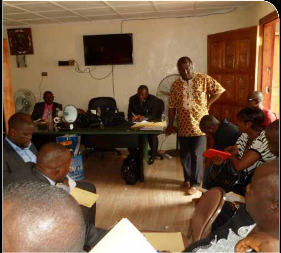
County attorneys from throughout Liberia receive SGBV training on the use of in-camera screens at trials.