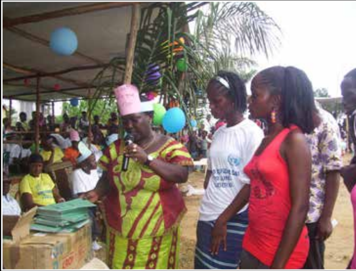
World Refugee Day is celebrated June 20 at Bahn Camp.