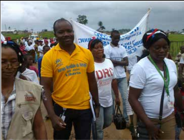
World Refugee Day is celebrated at Little Wlebo Camp.