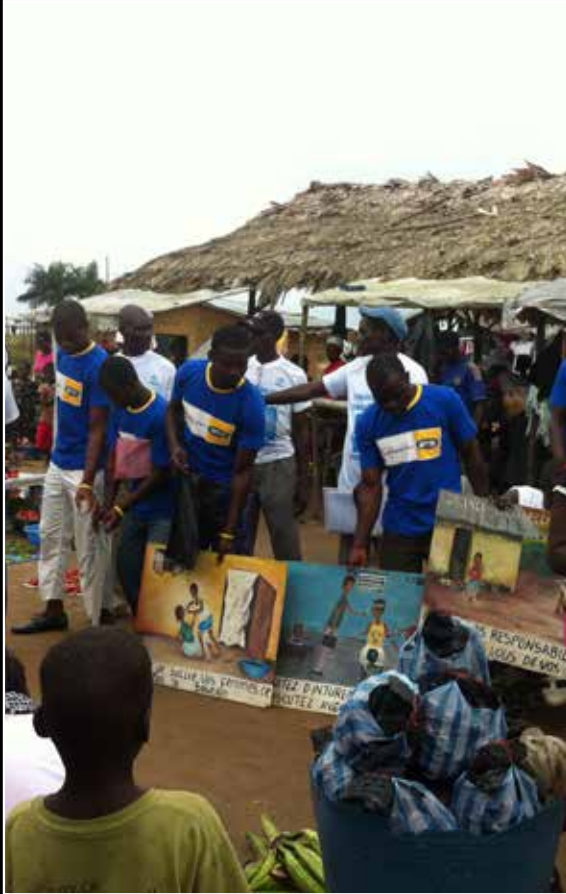
The Men's Involvement Group works to overcome sexual and gender-based violence (SGBV) at Little Wlebo Camp.