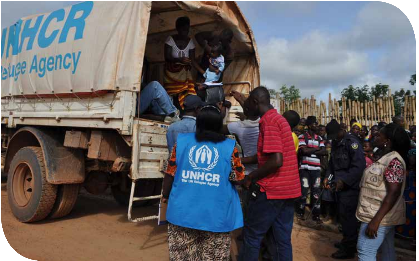
UNHCR staff assist Ivorian refugees repatriating to Côte d'Ivoire from Bahn Camp.