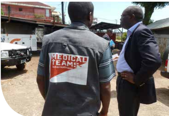
An MTI representative at UNHCR offices in Monrovia.

At the close of 2014, we salute our partners for a job well done.