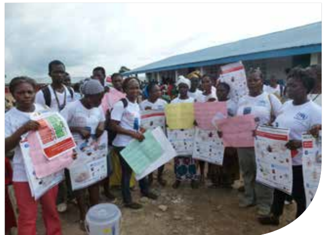
Widespread campaigns raise awareness about Ebola.

The year 2014 has been one of the most demanding yet for UNHCR's operations in Liberia, but it also has been one of the most successful, as UNHCR staff and all three refugee camps have remained Ebola-free.