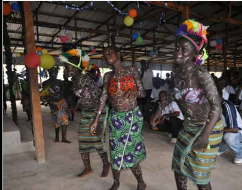
World Refugee Day is celebrated at PTP Camp.