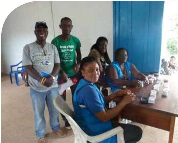
UNHCR Sub-Office Zwedru and LRRRC staff at PTP Camp distribute ID Cards.