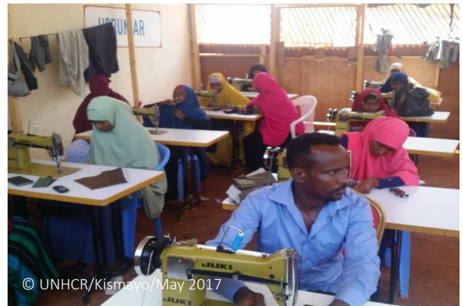
Returnees trained on farming [ left ] and in tailoring [ right ].