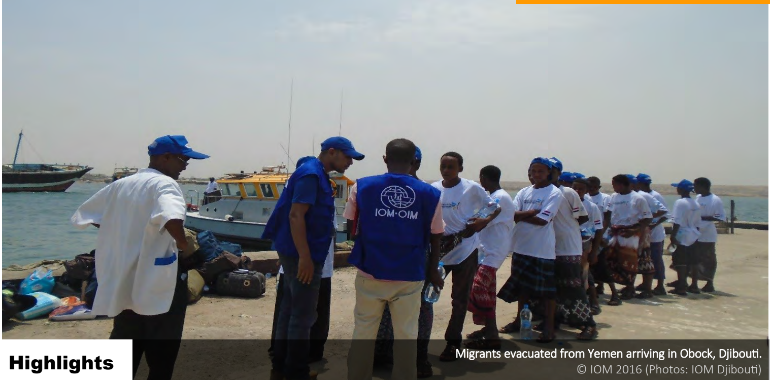
Migrants evacuated from Yemen arriving in Obock, Djibouti.