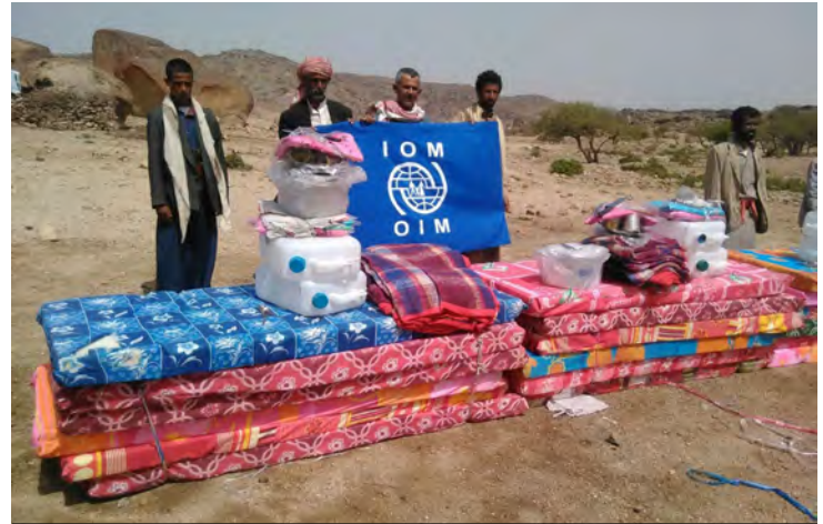
IDPs in Rajuza and Bart Al Anan districts received non-food items during an IOM distribution in Al Jawf governorate.

NFI/Shelter kits contained sleeping mats, blankets, mosquito nets, water buckets, IOM carrying bags, jerry cans, kitchen sets, plastic sheets and ropes.