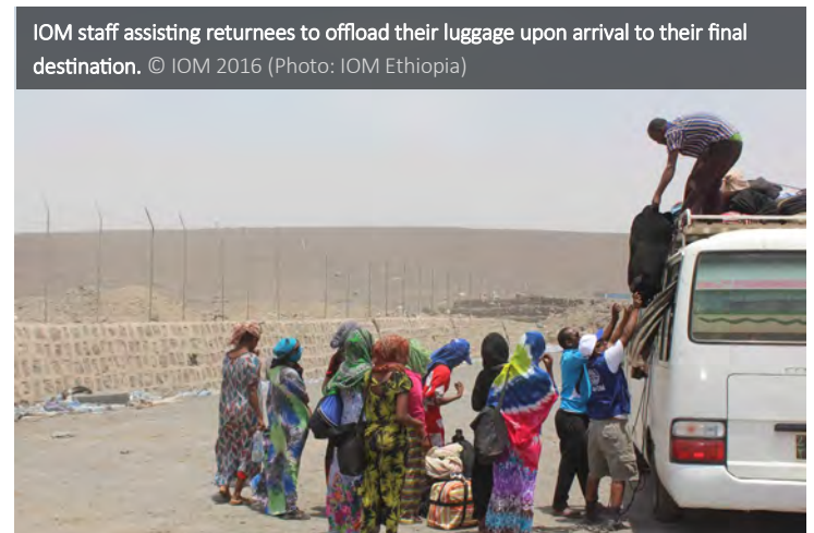
IOM staff assisting returnees to offload their luggage upon arrival to their final destination.

As of 31 July, 1,659 Ethiopians (249 females and 1,410 males) including 329 unaccompanied children have returned from Yemen having transited through Djibouti. All returnees have been provided with accommodation and other post-arrival assistance including emergency medical care, transportation assistance and family tracing and reunification.