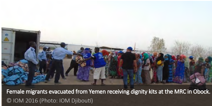
Female migrants evacuated from Yemen receiving dignity kits at the MRC in Obock.

In addition, IOM’s MRC in Obock continues to receive walk-in cases requesting OTA to return to their home countries. During the reporting period, IOM registered 94 stranded Ethiopian migrants including 13 unaccompanied children requesting assistance to return to their country of origin. Currently, there are 76 migrants hosted at IOM’s MRC.